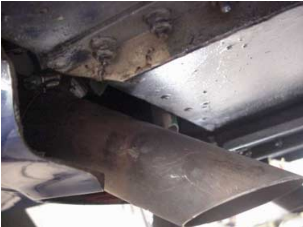
MINIMUM OF 15MM BETWEEN THE MUFFLER AND THE FUSELAGE BOTTOM SKIN