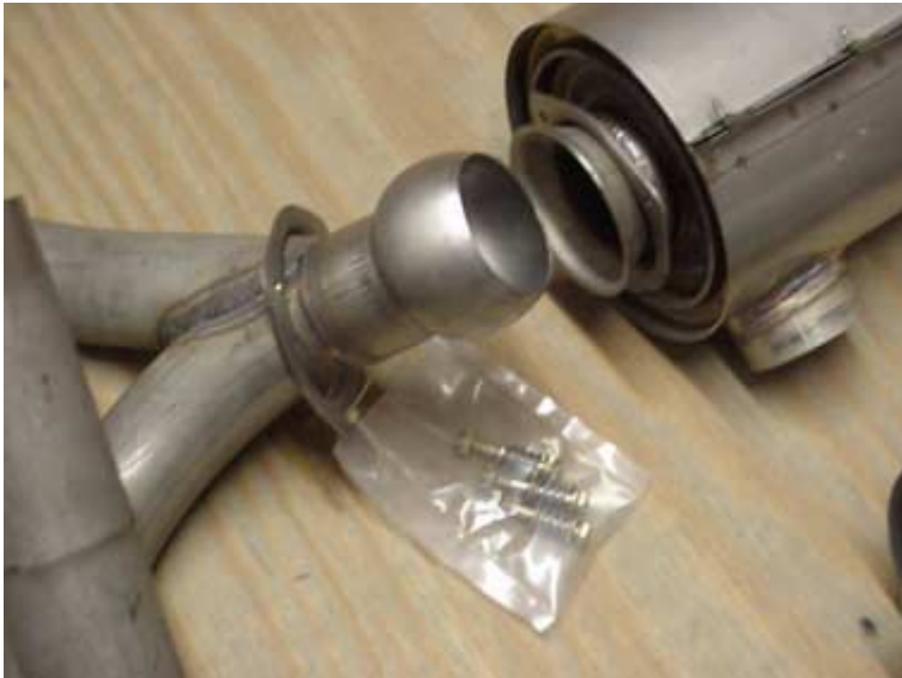
UNIVERSAL BALL JOINT