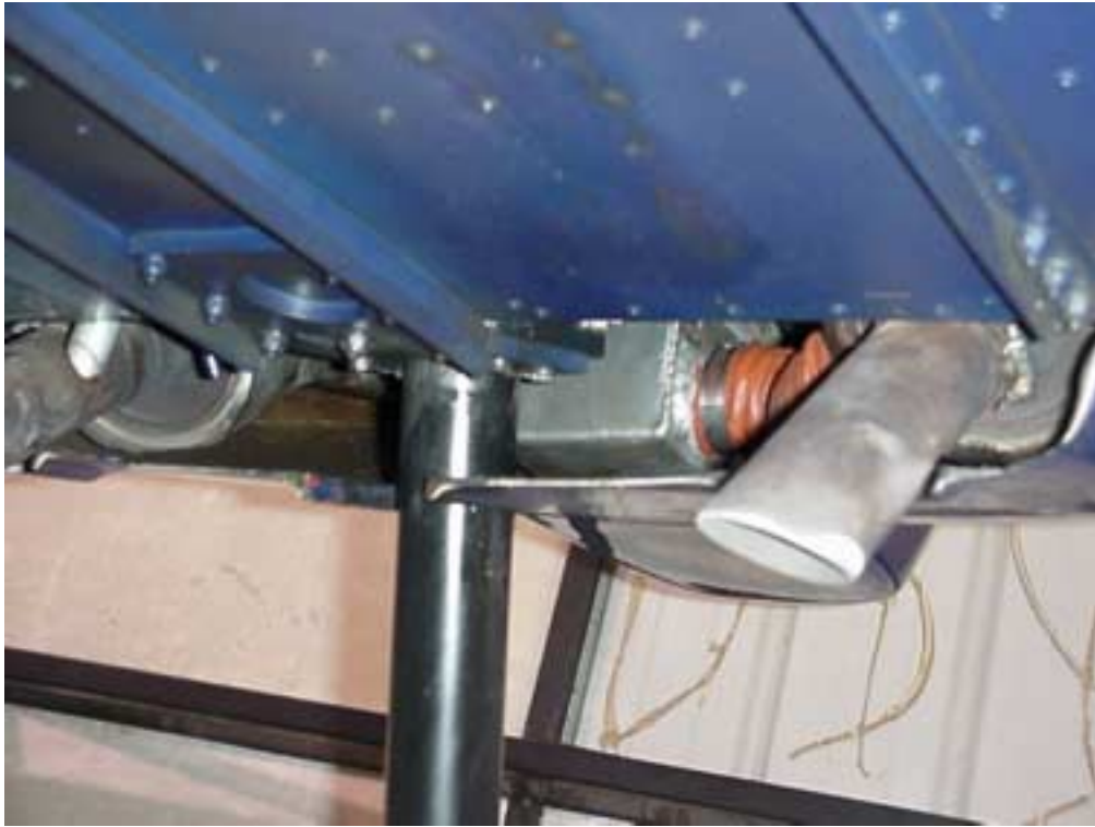
MUFFLER IN LINE WITH THE CUOUT IN THE LOWER COWL