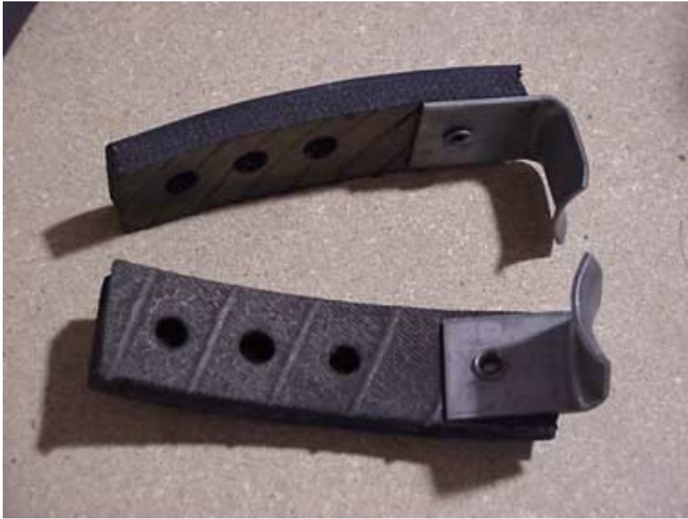
MUFFLER HANGERS TPH5