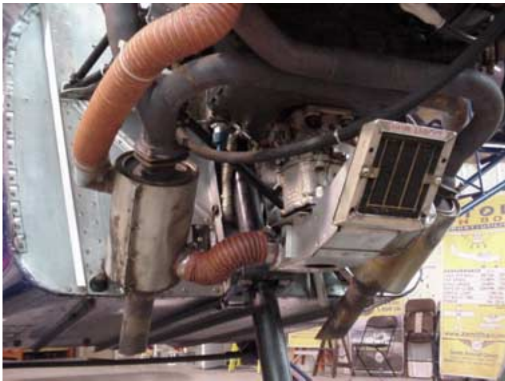
Cross over muffler. Carb heat is on right side, and cabin heat is on right side.