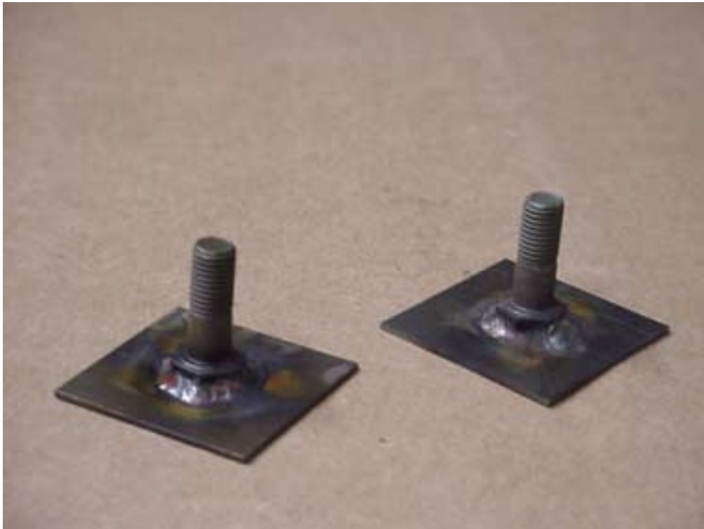
MUFFLER HANGER ATTACHMENT BRACKET 360-MHA5