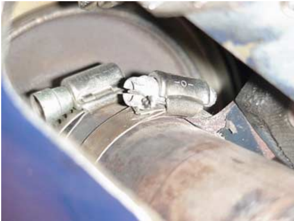
PHOTO: LOOKING UP AT LEFT SIDE FROM UNDERNEATH THE AIRCRAFT WITH THE COWL INSTALLED.

Hose clamp around pipe and steel bracket at the end of the muffler hanger.