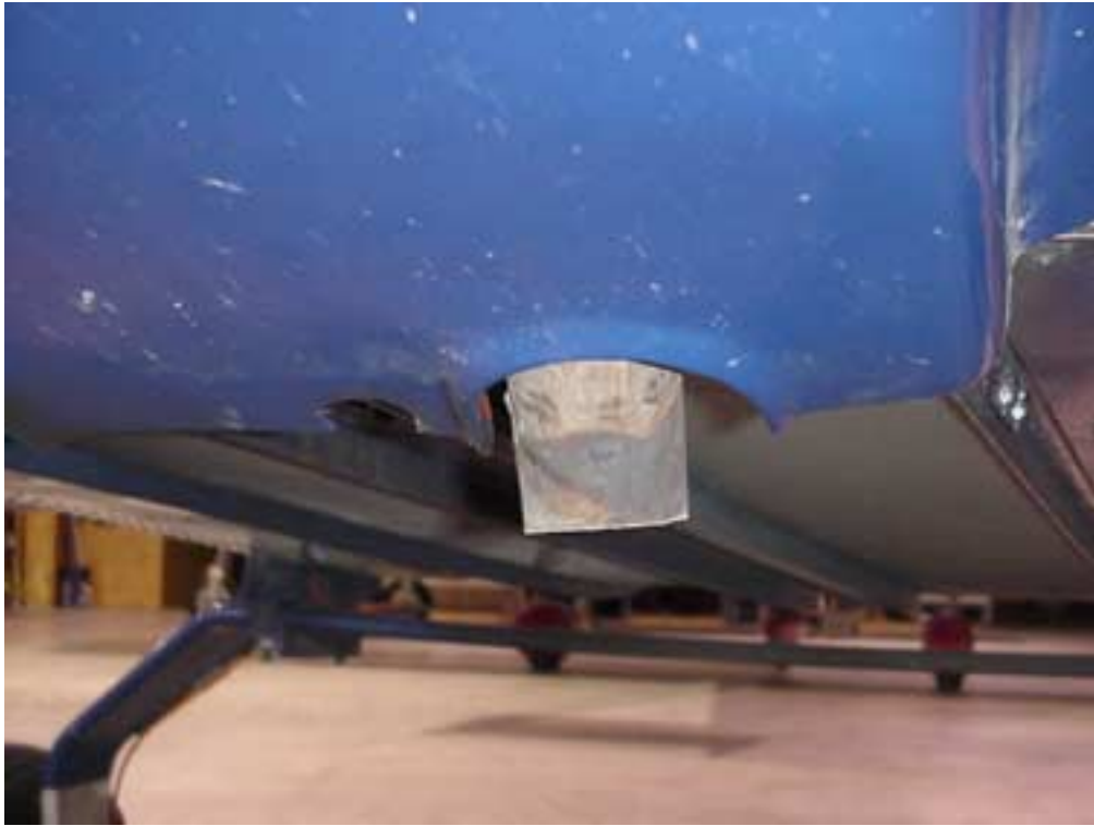
VIEW FROM FRONT