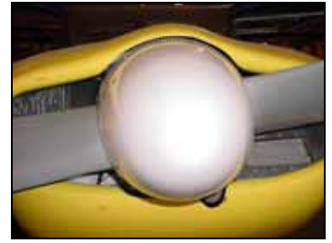
LEFT SIDE Clearance between the aft edge of the prop and cowl.