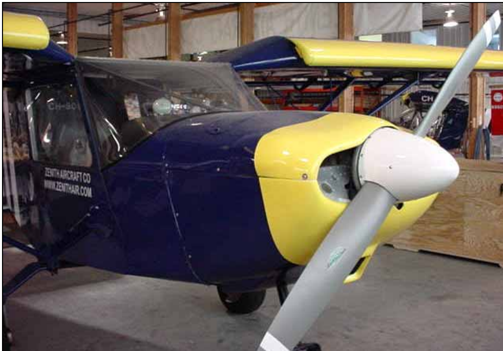
Spinner for the Lycoming 0-360 with a metal Sensenich propeller.

Includes: Rear bulkhead Front Bulkhead Dome