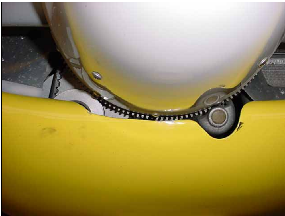
Photo taken standing on right side of spinner.

Cutout in bottom cowl to make room for spinner.