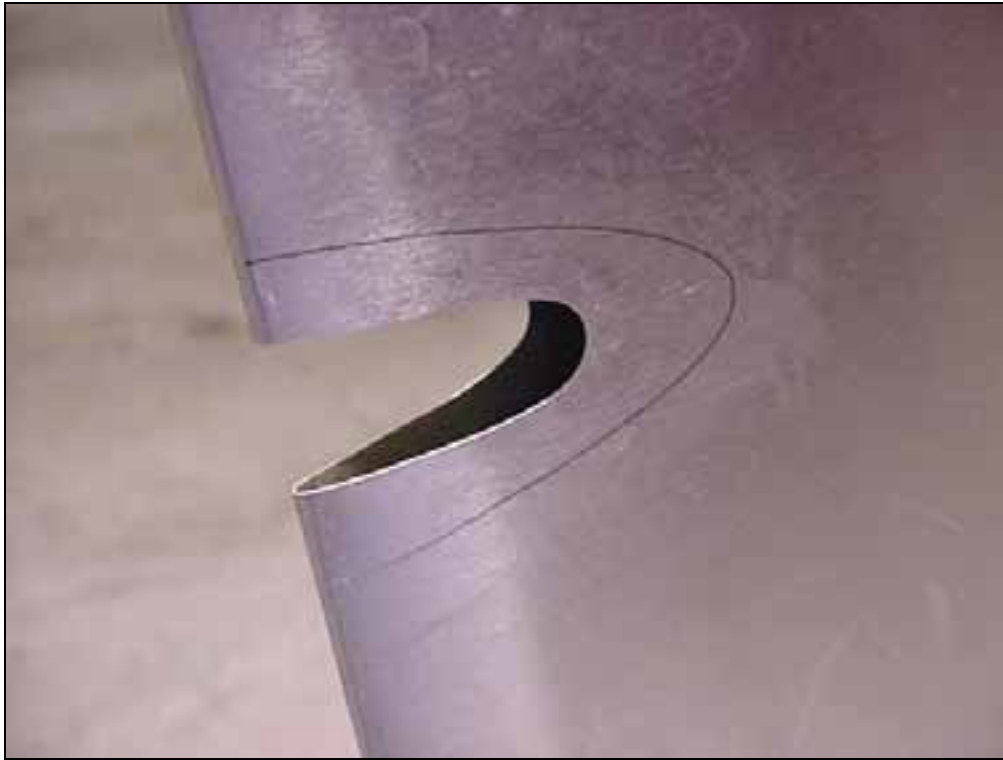
7R3-1 Rear Skin

Before cutting the skin, trace around the fiberglass fixtures to check for sufficient overlap (approximately 20mm) to the layout lines. Drill a large hole in the middle of the cutout area and use snips to cutout.