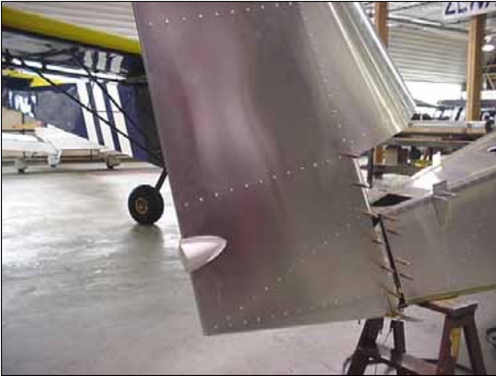
FTB Mounting Bracket

Measure up 160mm from the lower trailing edge. This is where the fiberglass bracket will be position, unless your Rudder has a dent on the trailing edge at a different location. Using the Bracket to cover up the dent.