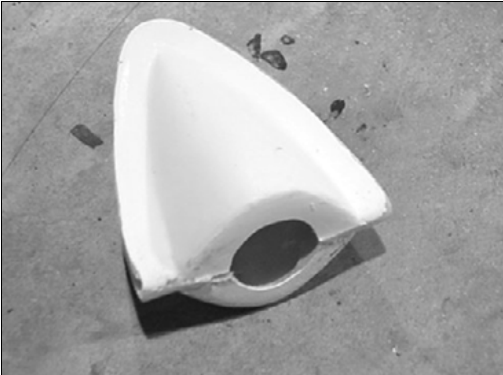
FTB Mounting Bracket

Measure up 160mm from the lower trailing edge. This is where the fiberglass bracket will be position, unless your Rudder has a dent on the trailing edge at a different location. Using the Bracket to cover up the dent.