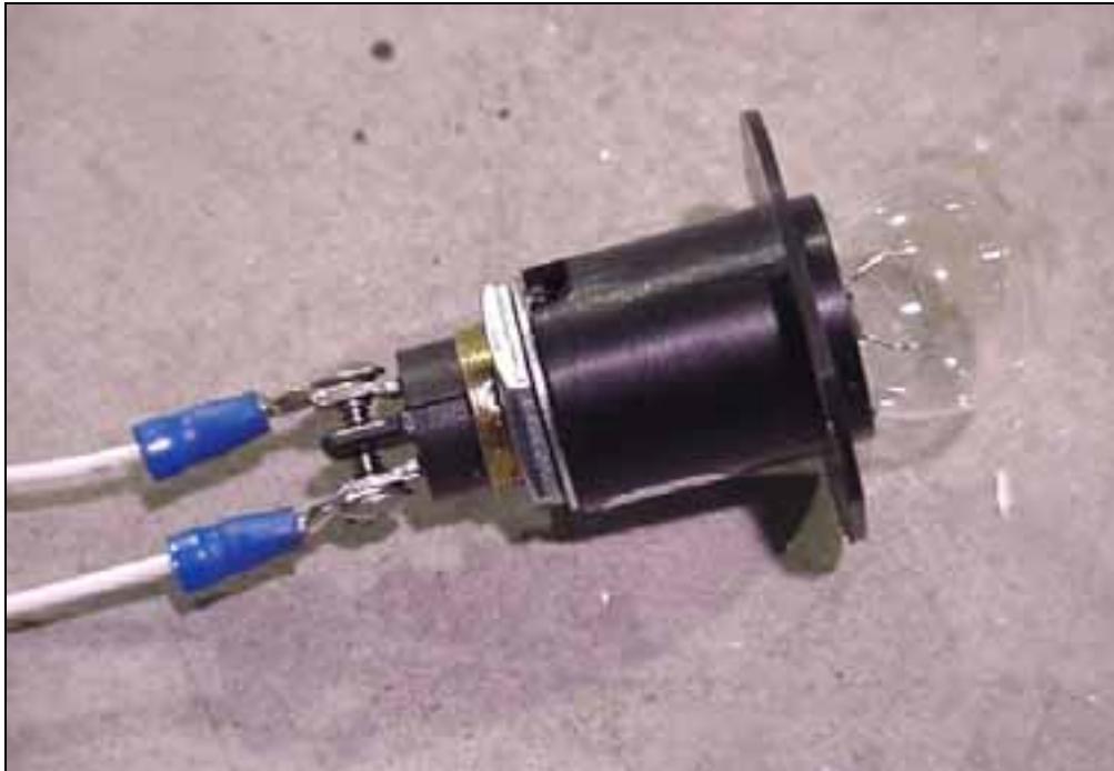
800TL Tail Light

Before cutting the skin, trace around the fiberglass fixtures to check for sufficient overlap (approximately 20mm) to the layout lines. Drill a large hole in the middle of the cutout area and use snips to cutout.