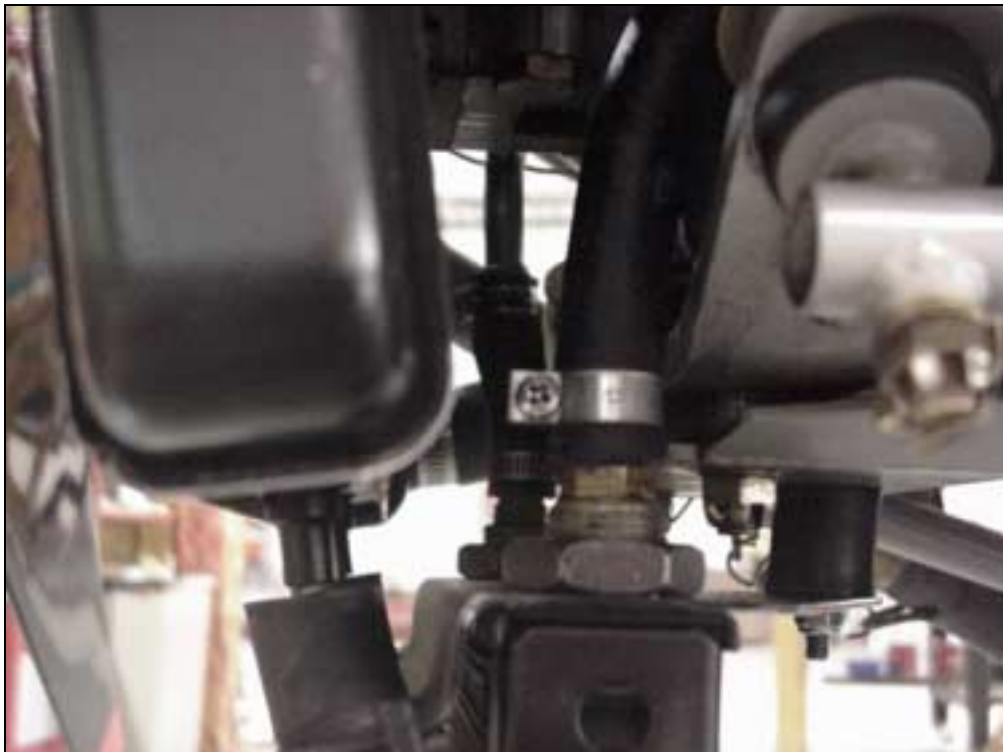
Detail of the top of the oil cooler and the bottom of the radiator

Hole approximately 54mm from the aft edge of the flat plate on the bottom of the engine mount.