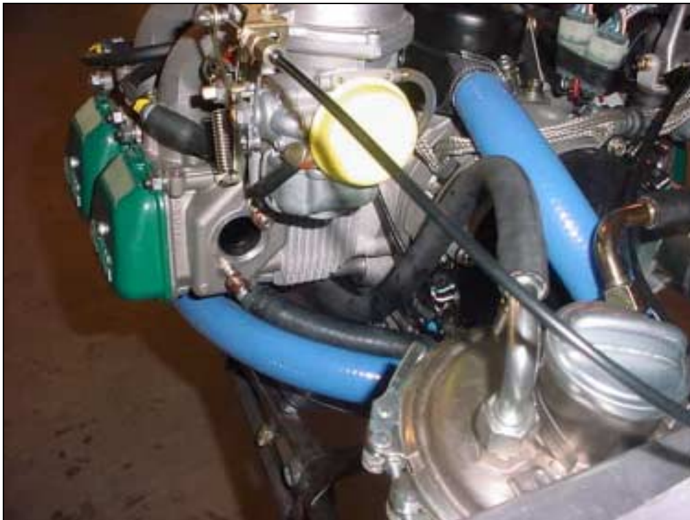
Oil line Routing