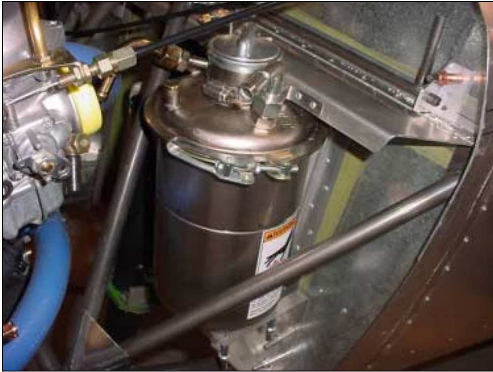
Rotax Oil reservoir supplied with engine.

Installed on left side between the tubes of the engine mount.