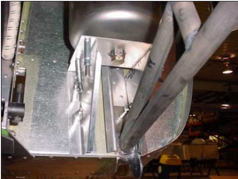
3 RIVETS A4 7E3-1R to 7E3-2R

Note: \frac{3}{4} " hole in the Top Bracket 7E3-1R to make room for the drain plug at the bottom of the oil reservoir