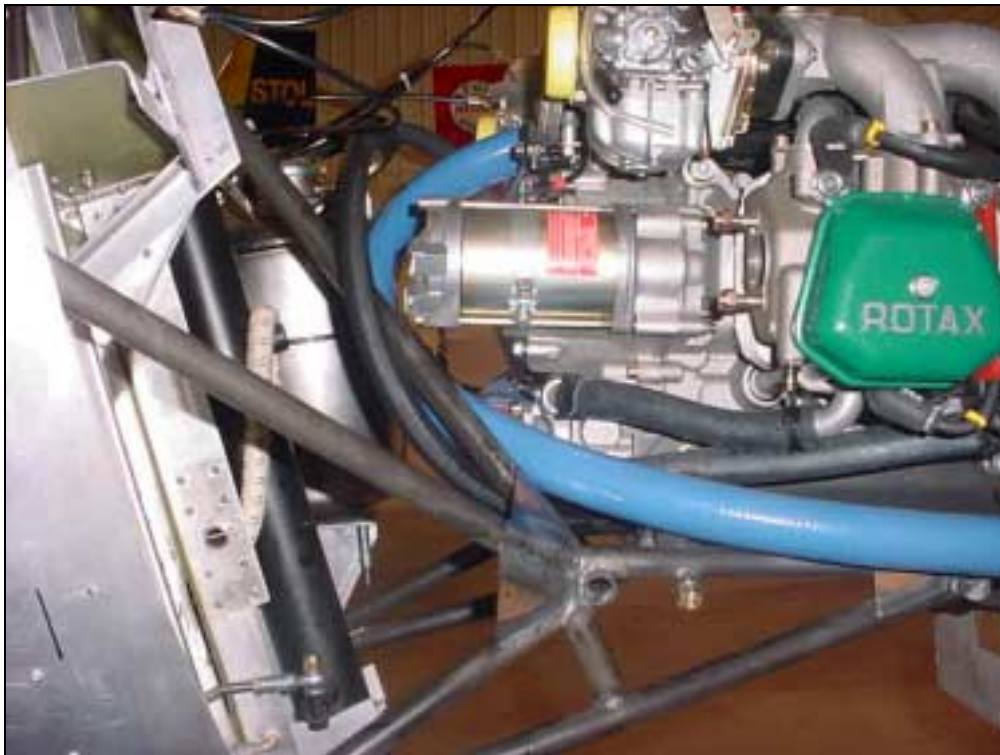
Detail of right side fitting to oil cooler.

Right side of engine, oil line routing around the engine mount.