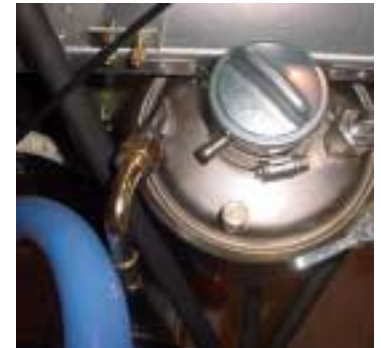
Oil reservoir in front of the Upper channel 7F7-1SP

The filler cap is above the Upper Channel 7F7-1SP