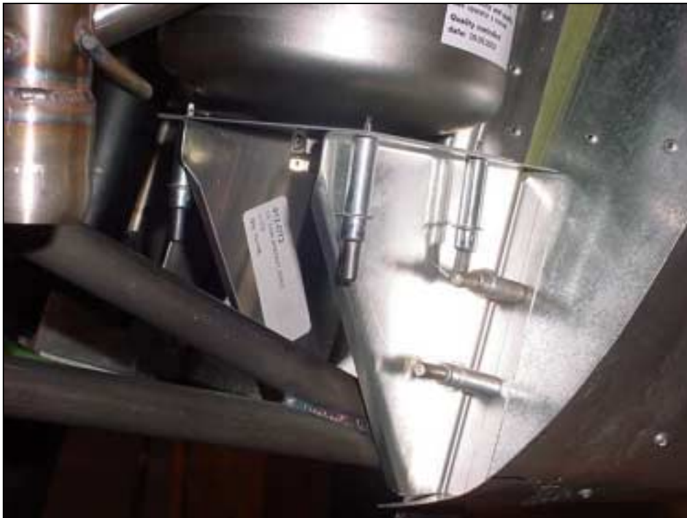
4 RIVETS A4 7E3-2R into 7F1-1