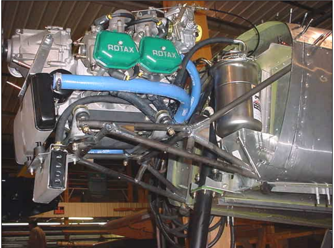
Detail of left side