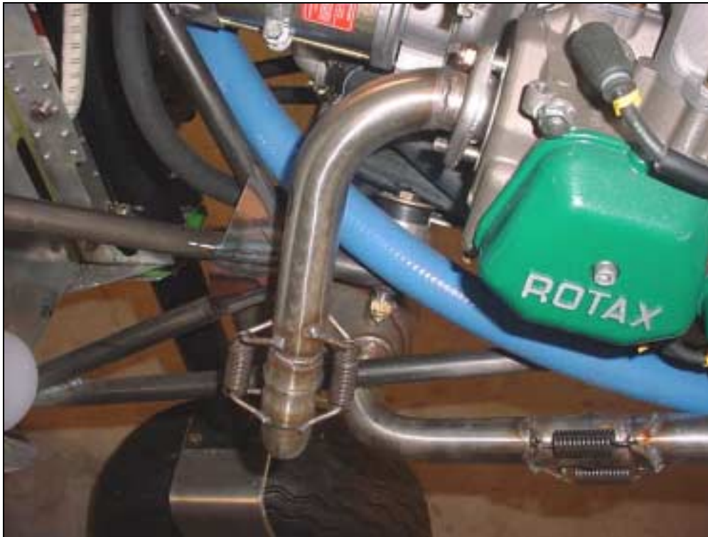
Right rear elbow