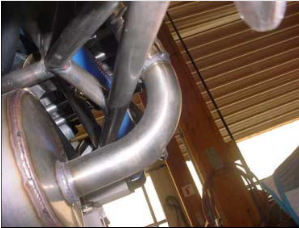
Right side, looking up from behind the firewall