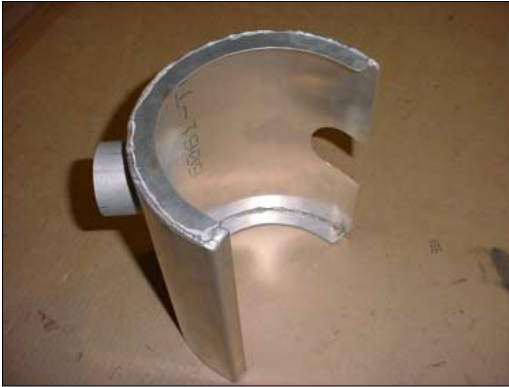
HEAT SHROUD HS-7

Cutout to go around tail pipe. Flange outlet connects Scat hose to CHO-1 (2" flange on firewall)