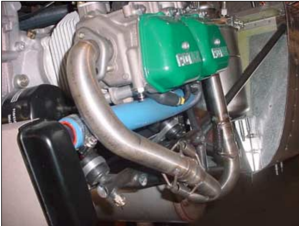
Front left elbow