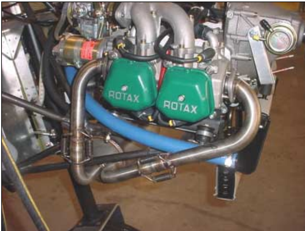
Photo of right side