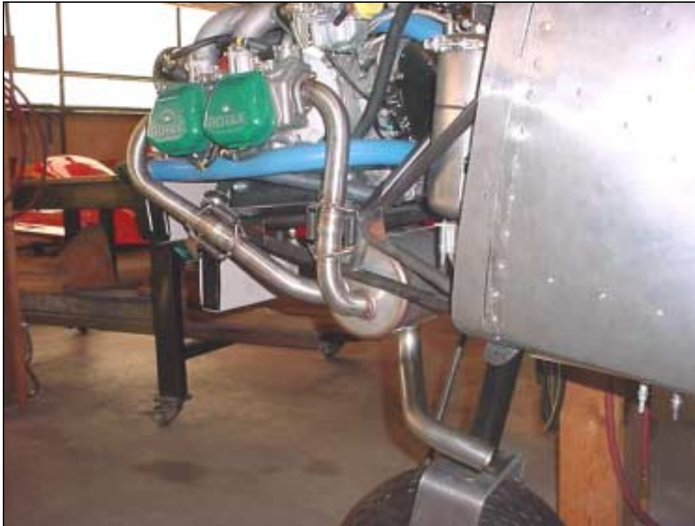
Photo of left side