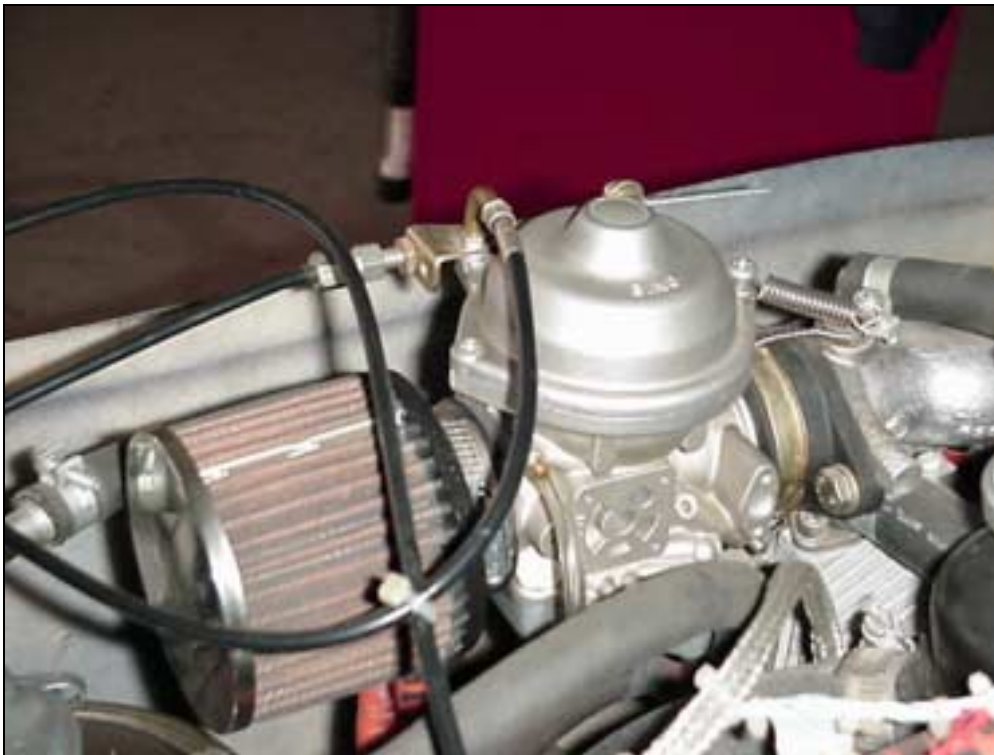
Photo of 912 engine without the Tuned Rotax Airbox Photo of left side