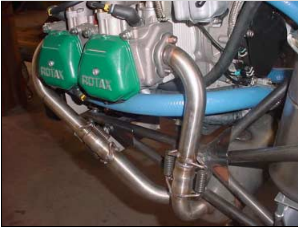
Rear left elbow