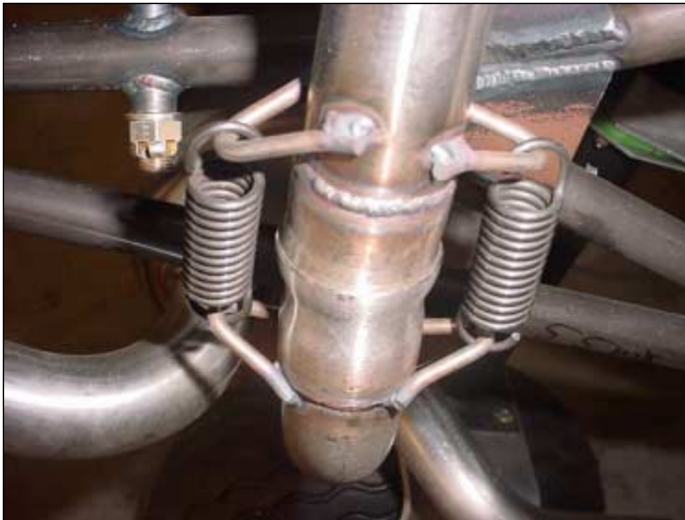
EXHAUST SPRING 938-790

Silicone may be paced on the springs to reduce vibration noise. (not shown on this photo)