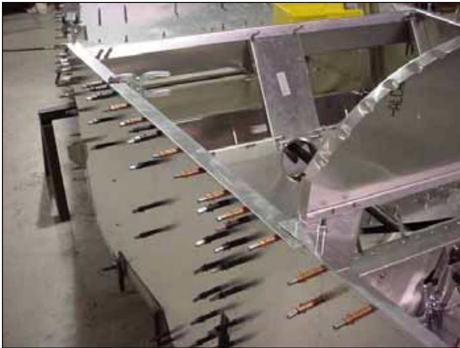
At the instrument panel, the Panel Gusset 6B12-5 overlaps on top of the doubler 3 RIVETS A5