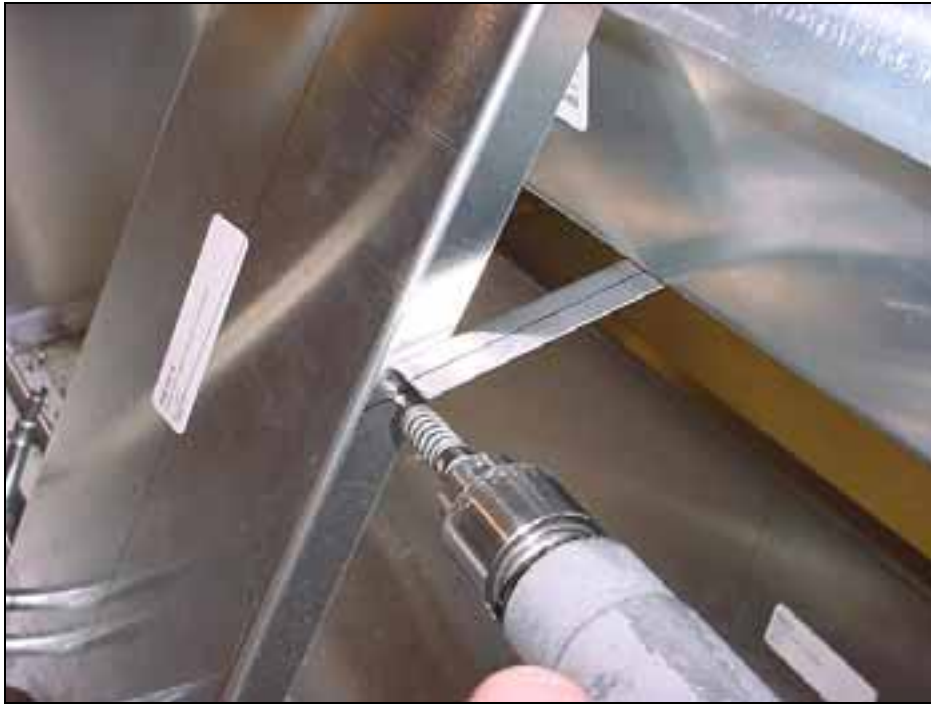
1 RIVET A4 L angle to 6B16-2 (Left & right flange).