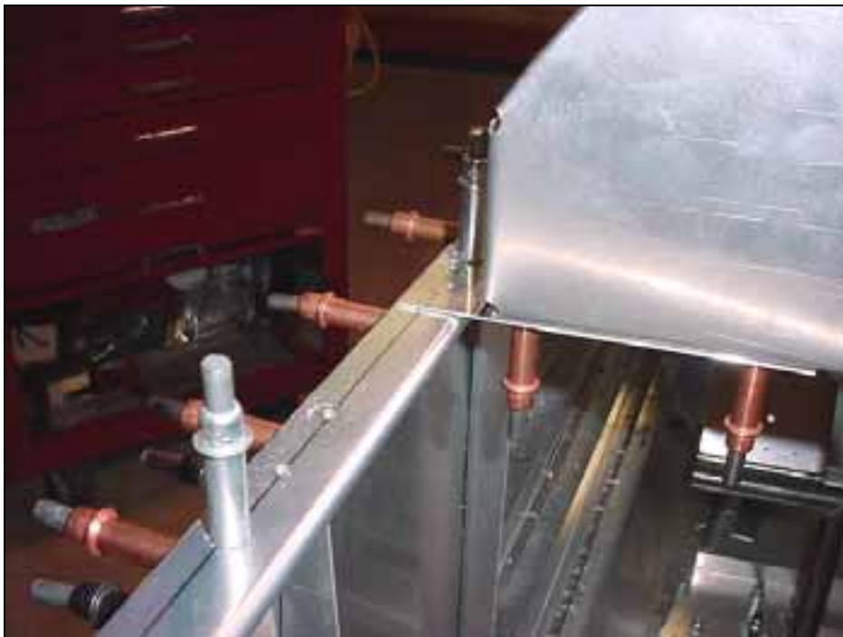
Detail of panel gusset 6B12-5 (front)