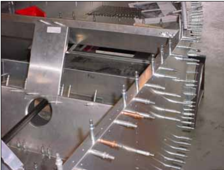
Left side: view from front.