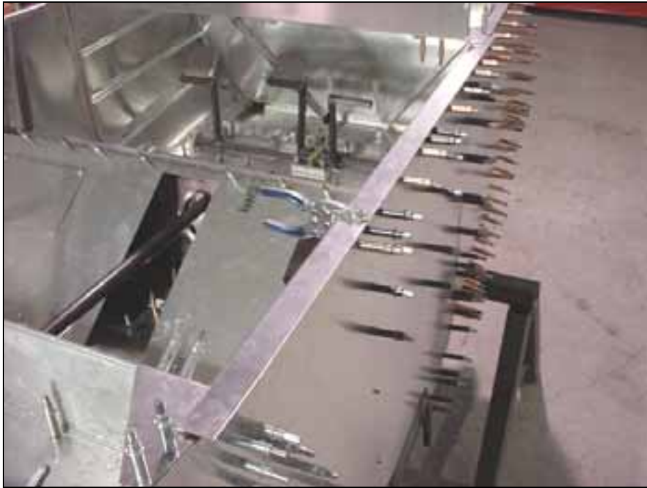
Photo of right side, looking forward (Gusset 6B15-1 is at the bottom).

Note: Lengthwise: the doubler overlaps the gusset for 2 rivets A5. Widthwise: measured from the edge of the fuselage along the front of the gusset, the doubler overlaps on 20mm. If necessary make the cutout deeper to make room for the gusset 6B21-8.