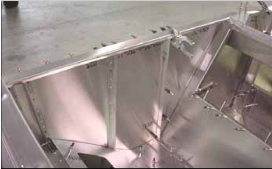
Trim parallel to the front flange of the baggage floor support 6B16-1.