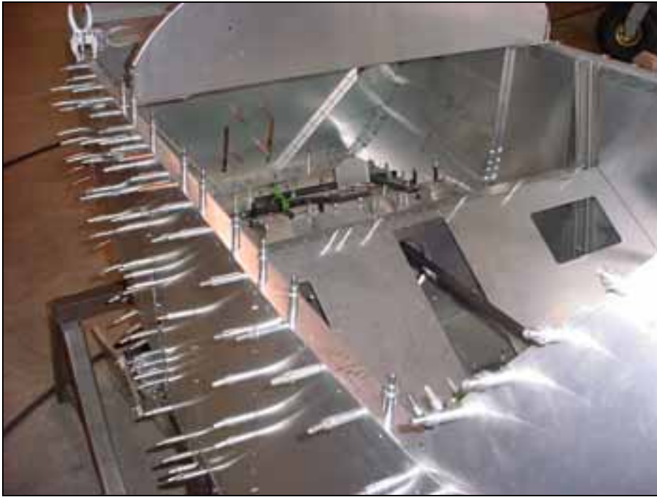
Left side: viewed from rear.