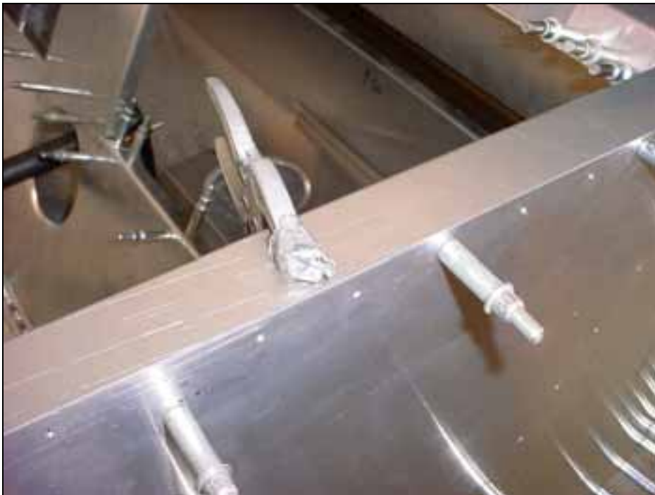
Position the front I/B flange of the doubler against the longeron, then adjust the doubler to bring the outer edge flush with the side of the fuselage and clamp in place.