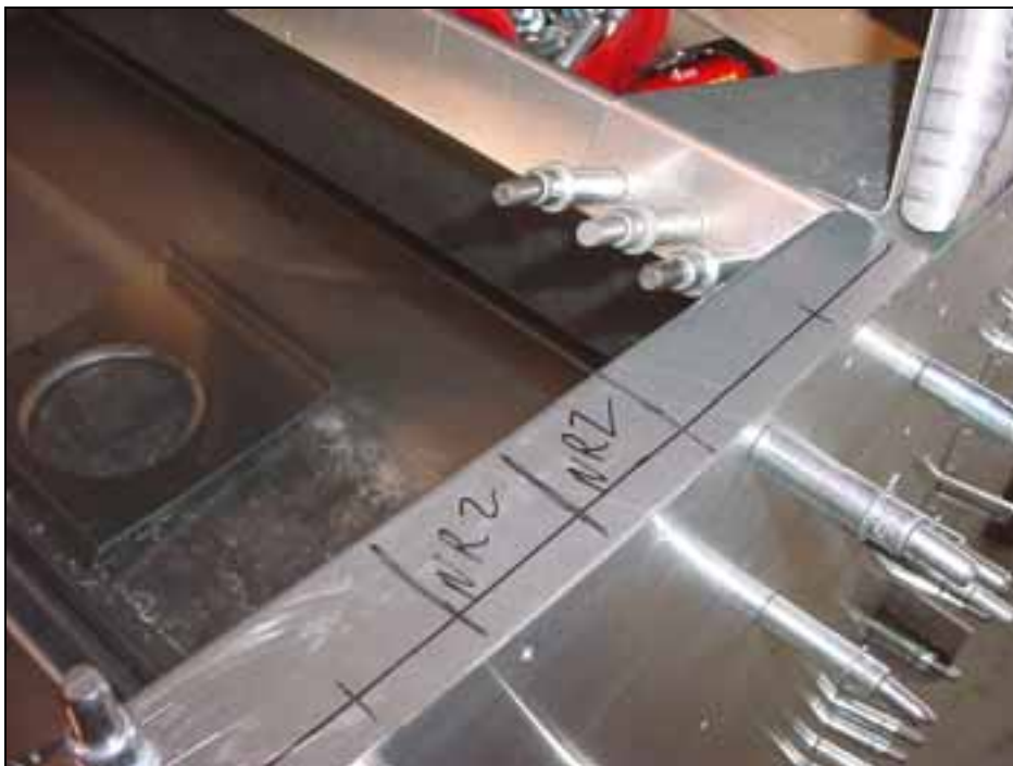
Locate the no rivet zone for the striker stud 6C2-1