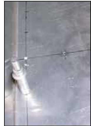
A4 PITCH 40 6B16-1 to L angles.

Layout the rivet lines for the 2 L angles on each side of the center seat back channel 6B16-2