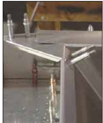
Trim back side flange to the same angle as the upper seat & baggage floor support 6B16-6