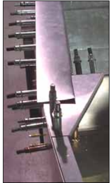
Aft overlap on top of gusset 6B15-1