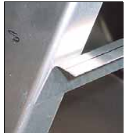
Trim the overhang.

Clamp the L angles to the sides of the back channel.