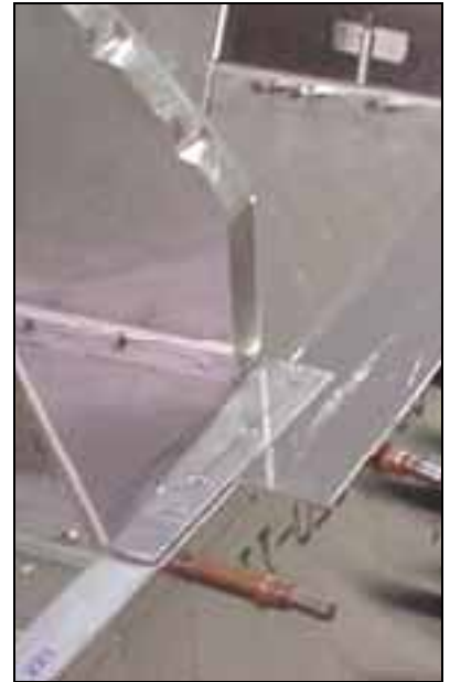
Front end, overlaps underneath panel gusset 6B12-5

Note: Lengthwise: the doubler overlaps the gusset for 2 rivets A5. Widthwise: measured from the edge of the fuselage along the front of the gusset, the doubler overlaps on 20mm. If necessary make the cutout deeper to make room for the gusset 6B21-8.