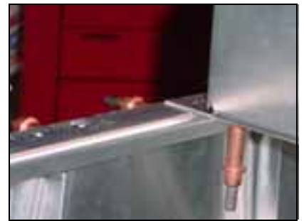
Doubler extends underneath instrument panel