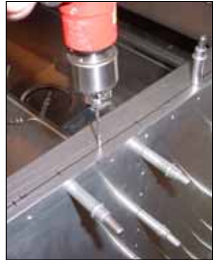
A4 PITCH 40 6B16-4 to 6B11-1