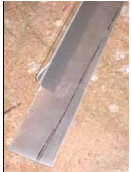
Detail of aft end.