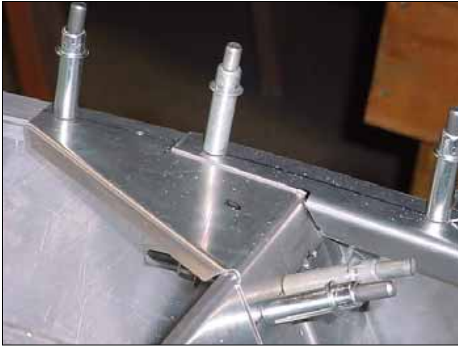
Detail of left side (rear) gusset 6B15-1