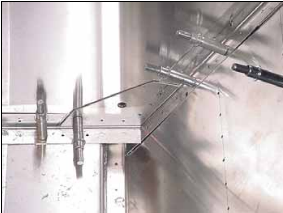
Plate overlaps on the outside of the L angles.