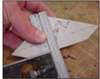
SEAT BELT ATTACHMENT DOUBLER PLATE 6B18-3

Plate overlaps on the outside of the L angles.