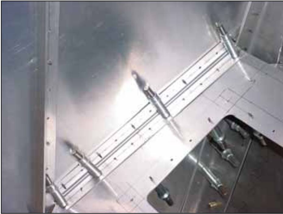
Another view of the L angle in the corner of the front seat panel 6B15-4 and the forward side skin 6B11-2