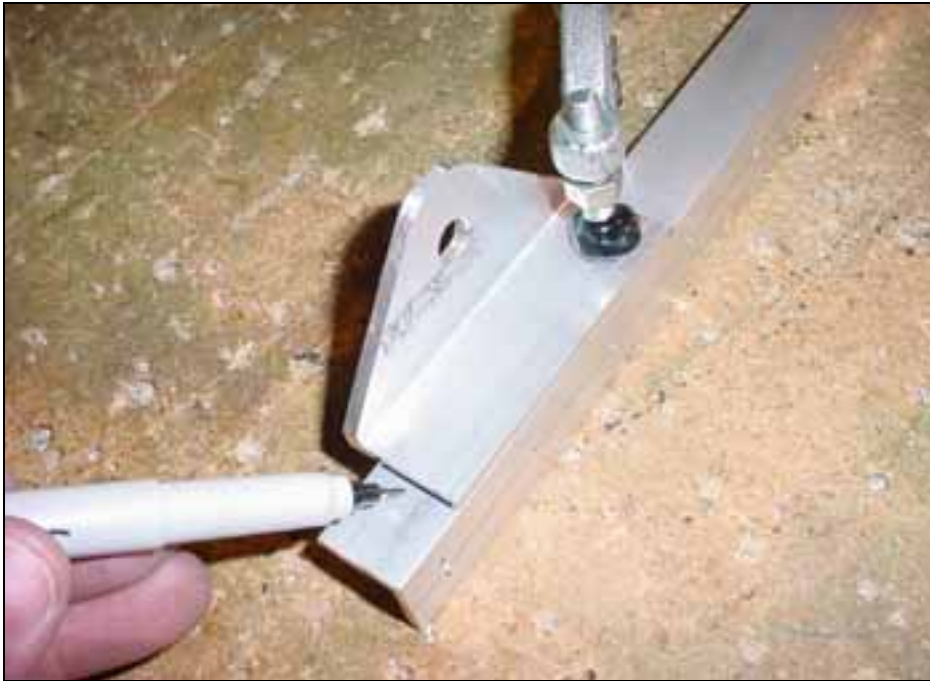
Remove the upright. Mark the top and bottom of the attachment on the extrusion.