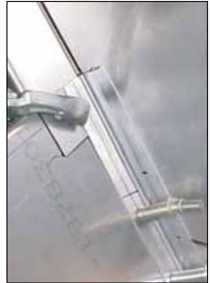
Left side: Note the no rivet zone for the flap mount gusset 6B19-9