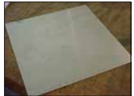
A5 PITCH 25 Front: 6B18-6 into 6B15-5 Rear: 6B18-6 into 6B5-1

Ref. bottom right diagram on drawing 6-B-18