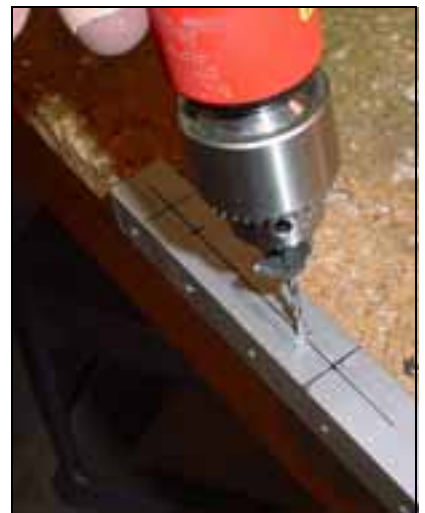
Layout the bolt holes. Pre-drill.