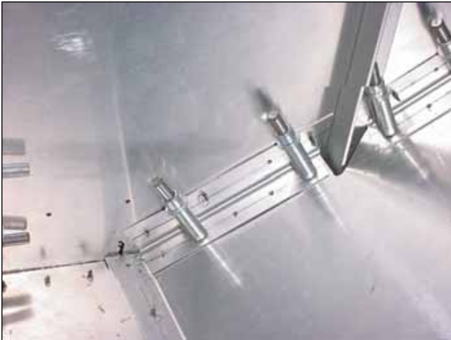
Short L angle behind the gear upright 6B11-3