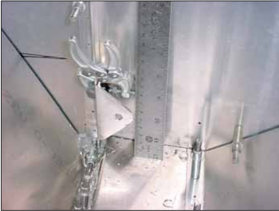
Positioned on the front side of the gear upright 6B11-3