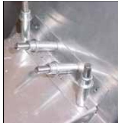
L angle in the corner of the arm rest cover 6B18-2 and the center seat back channel 6B16-2