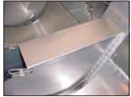
ARM REST COVER 6B18-2

Clamp the cover on over the arm rest sides.