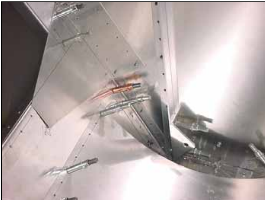
L angle in the corner of the rear seat panel 6B5-1 and the forward side skin 6B11-2