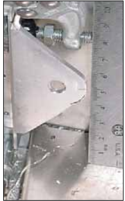
Clamp the seat belt attachment 50mm up from the top of the gear channel 6B8-5