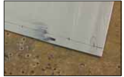
SEAT BOTTOM 6B18-6