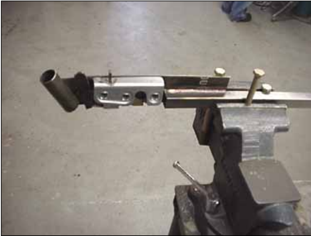
Add curvature to the canopy frame to fit the fuselage.