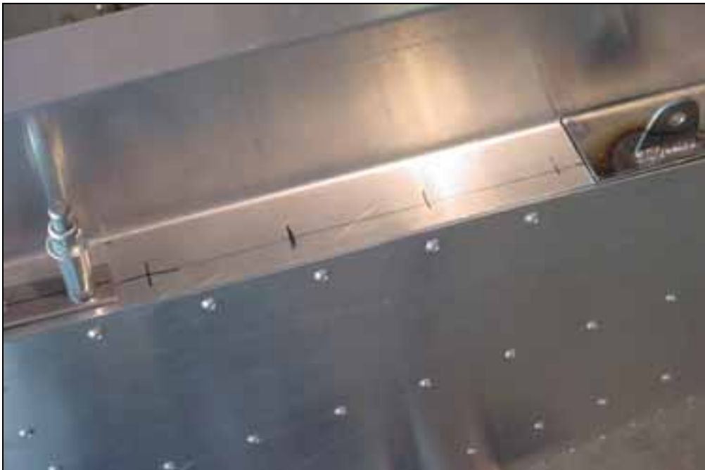
Finish drilling the holes in the bottom flange.