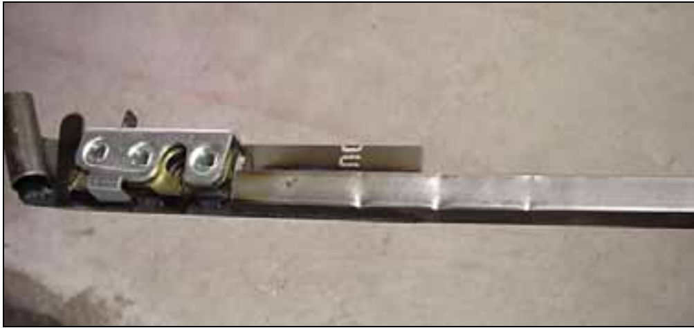
Photo of left canopy frame.