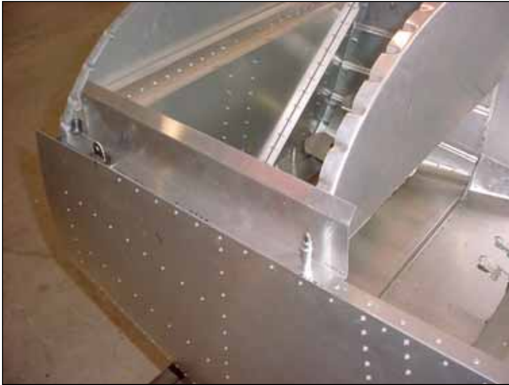
Cutout in the bottom flange to make room for the upper engine mount fitting.