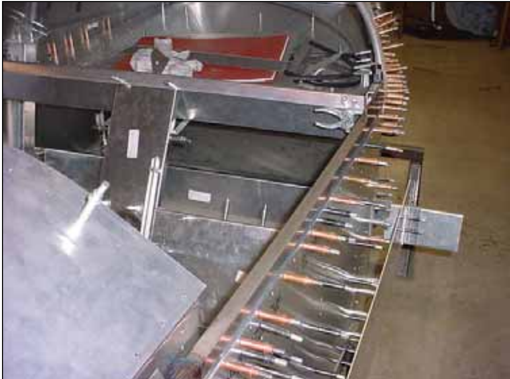
Left side. Check that the Canopy Side Frame follows the curvature of the fuselage.