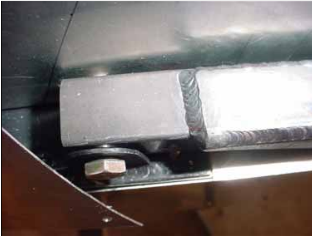
Insert the AN4 bolt for the front pivot.