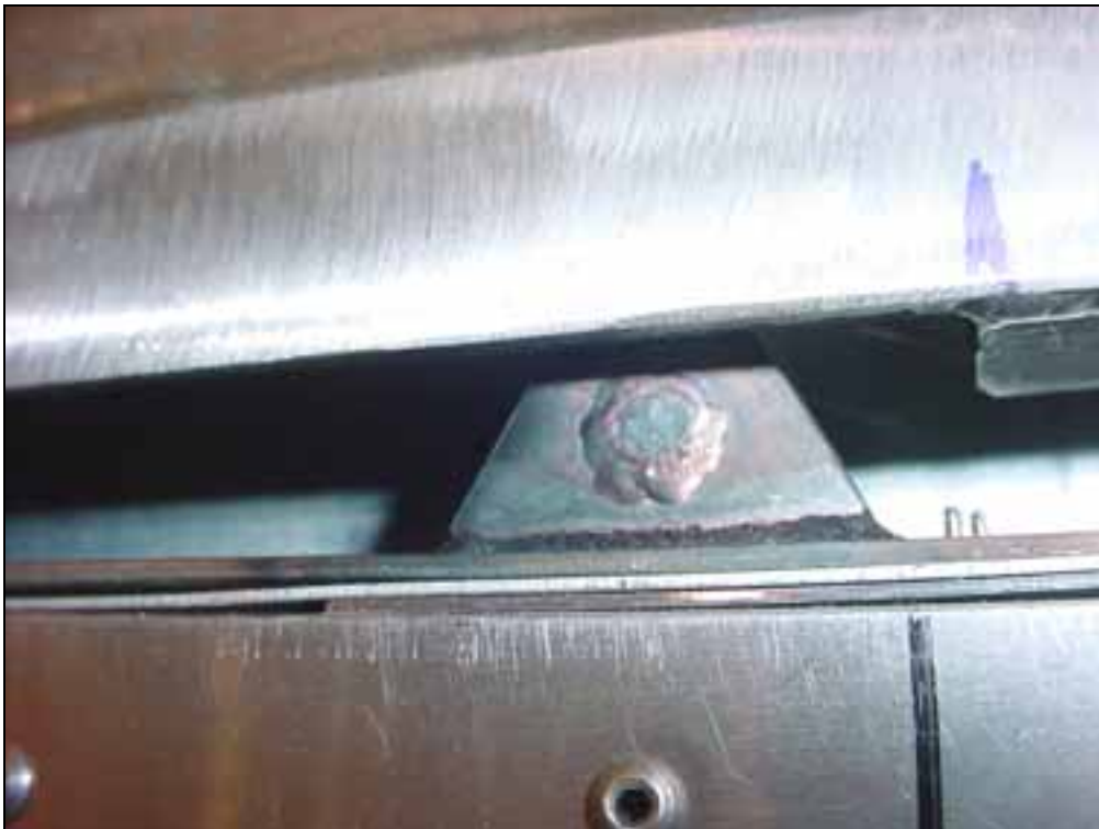
Position the bottom bracket 6C2-2 on the fuselage, the front edge is flush with the gusset 6B12-5. Ref top left diagram on drawing 6-C-1. Check that the welded plate with stud does not interfere with the square tube.