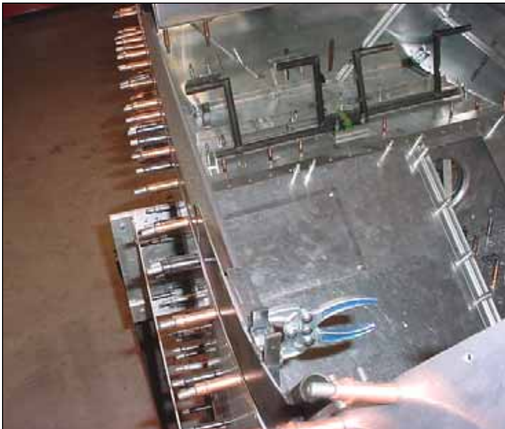
Clamp the striker stud to the longerons.

Close the canopy latch 6C2-3 over the striker stud 6C2-1