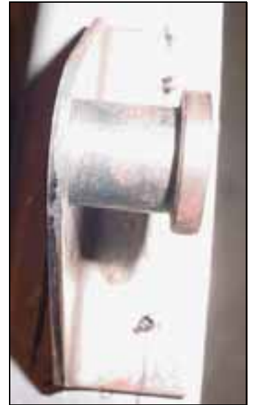
STRIKER STUD 6C2-1

Close the canopy latch 6C2-3 over the striker stud 6C2-1