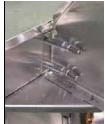
Instrument panel: The Side Panel 6C1-1 is riveted to the side of the instrument panel.