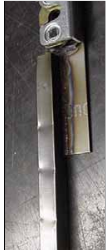
Kinks at the location of the middle bolt.