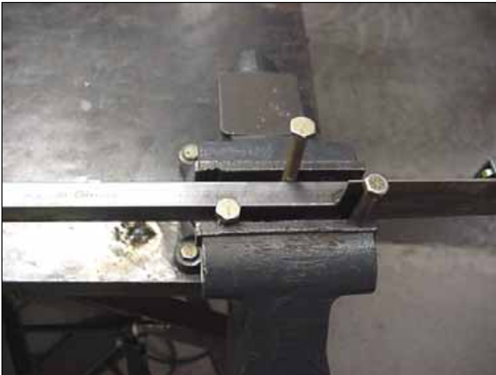
Use 3 bolts in a vise to kink the square tube.