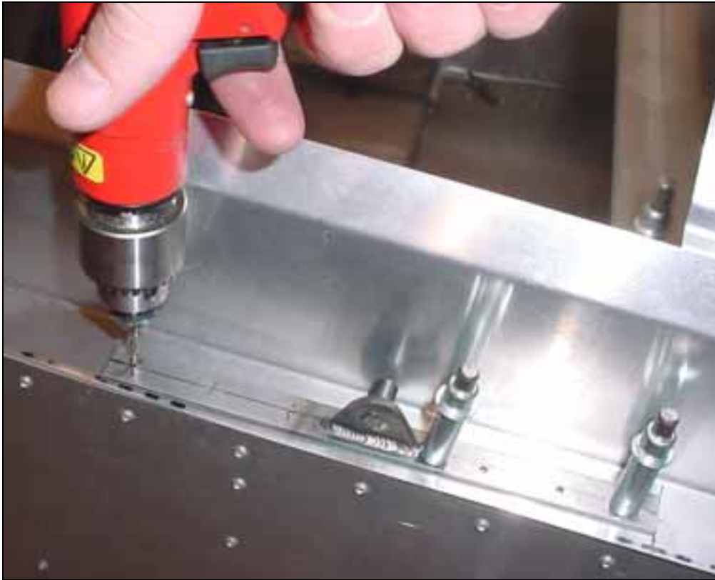
Finish drilling the holes in the bottom bracket 6C2-2