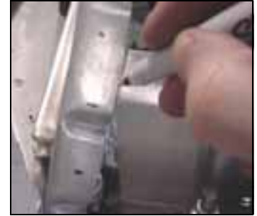
Trim the top flange flush with the aft edge of the firewall flange.