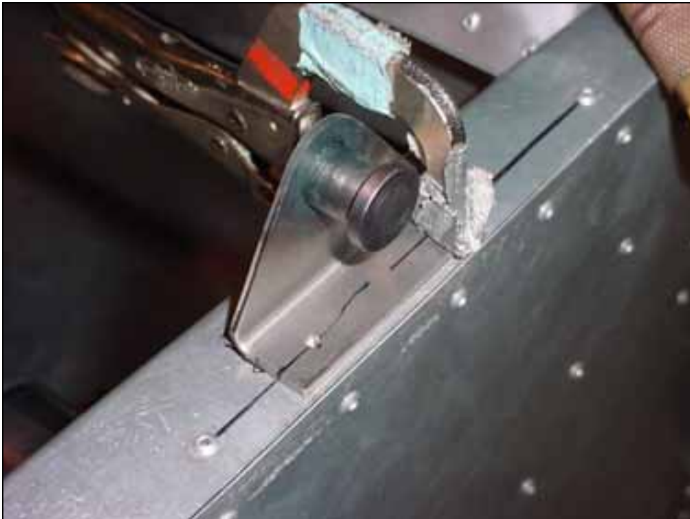
Mark the longeron center line on the bottom flange of the stud, Drill and Cleco.