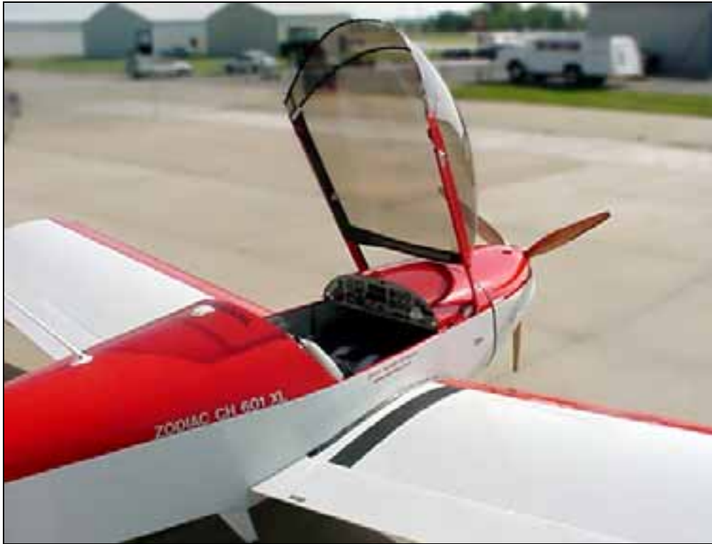
Forward opening canopy Tapered