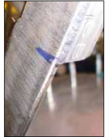
On the side of the canopy frame, mark the front end of the square tube.