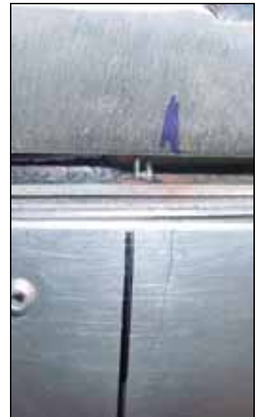
With the side frame in the closed position, mark the position of the square tube on the fuselage side skin.