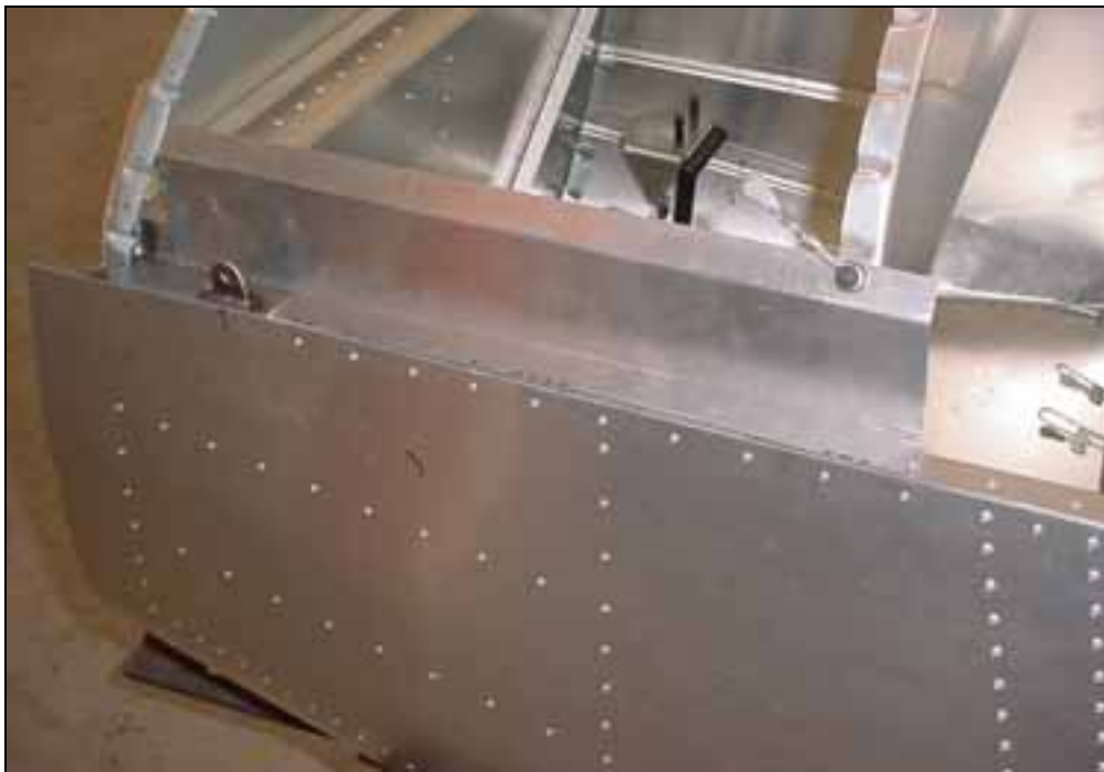
Clamp the top flange to the instrument panel.