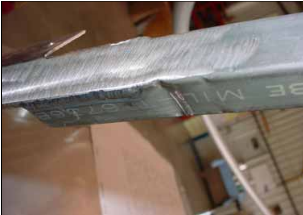
Photo of front underside of the canopy frame.