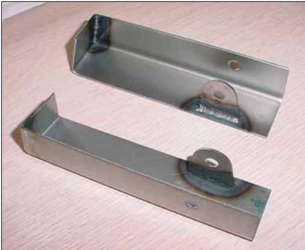
The 3/8" hole in the upper engine mount fitting & canopy hinge 6B6-4 is drilled before the part is installed to the upper front longerons 6B11-2 Ref. section 6-B- 11B page 6 of 12