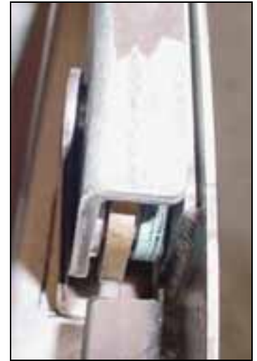
Center the stud under the latch.