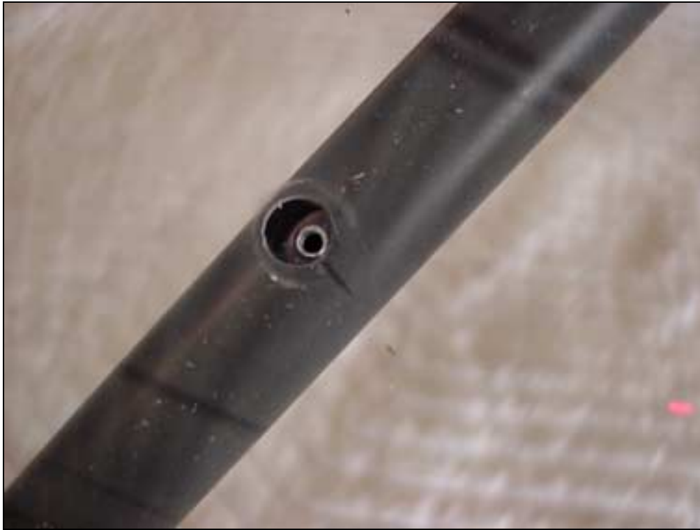
5/16" hole in bubble canopy.

Tap the holes in the bent tube frames 6C3-1 and 6C3-1 and along the Inside Angle 6C3-4 before the canopy is installed.