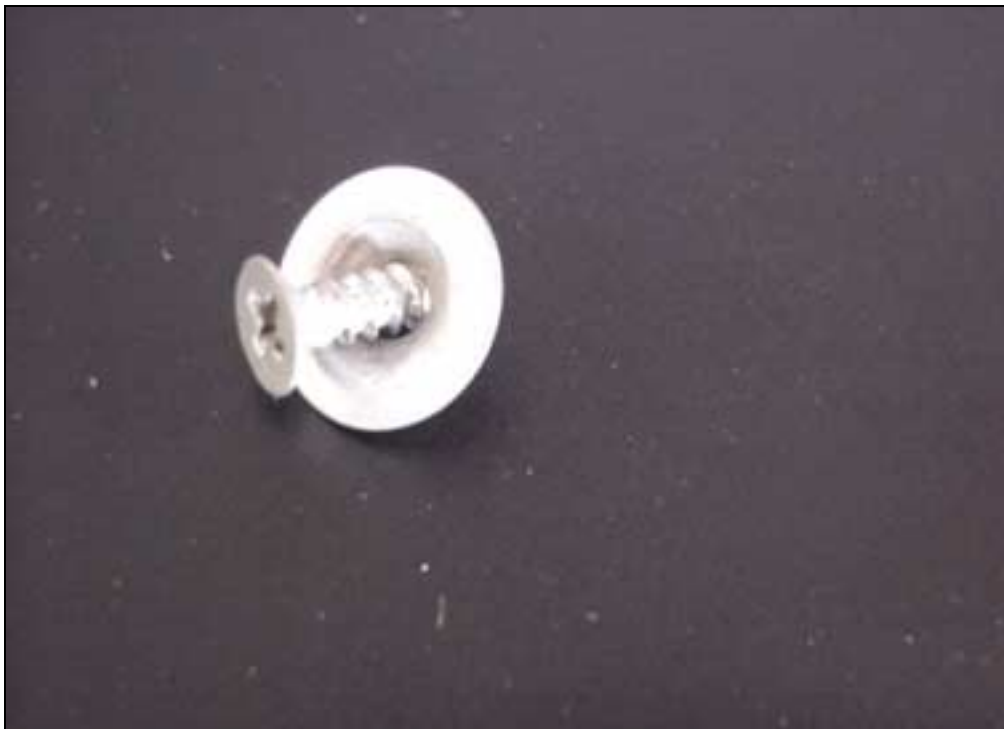
SHEET METAL SCREWS BLUNT END No. 6 X 5/8" NAS548P8-10

Tap the holes in the bent tube frames 6C3-1 and 6C3-1 and along the Inside Angle 6C3-4 before the canopy is installed.