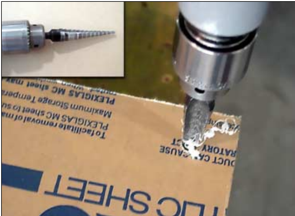
Uni-bit or step drill to open up the pilot holes in the bubble canopy.

US Industrial Tool www.USTOOL.com P/N TPA5611