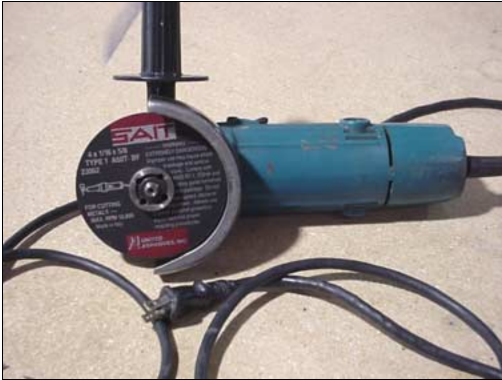
Hand held electric grinder With cutting disk