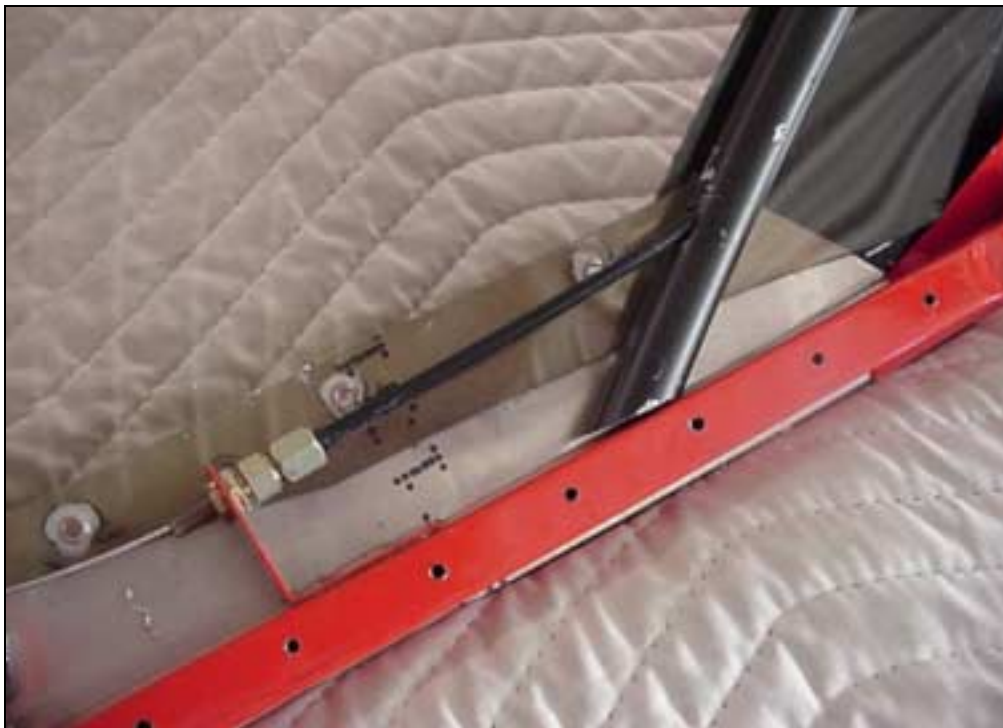
Cable Stop Adjuster with Sleeve 25-0700

Drill a 1/4" hole in the Cable Support for the cable. Ref. Bottom right diagram on drawing 6-C-4. (Cable for the right side is on the front side of the handle) Drill a 1/16" hole in the Fairlead, drill and rivet the Fairlead on the Support.