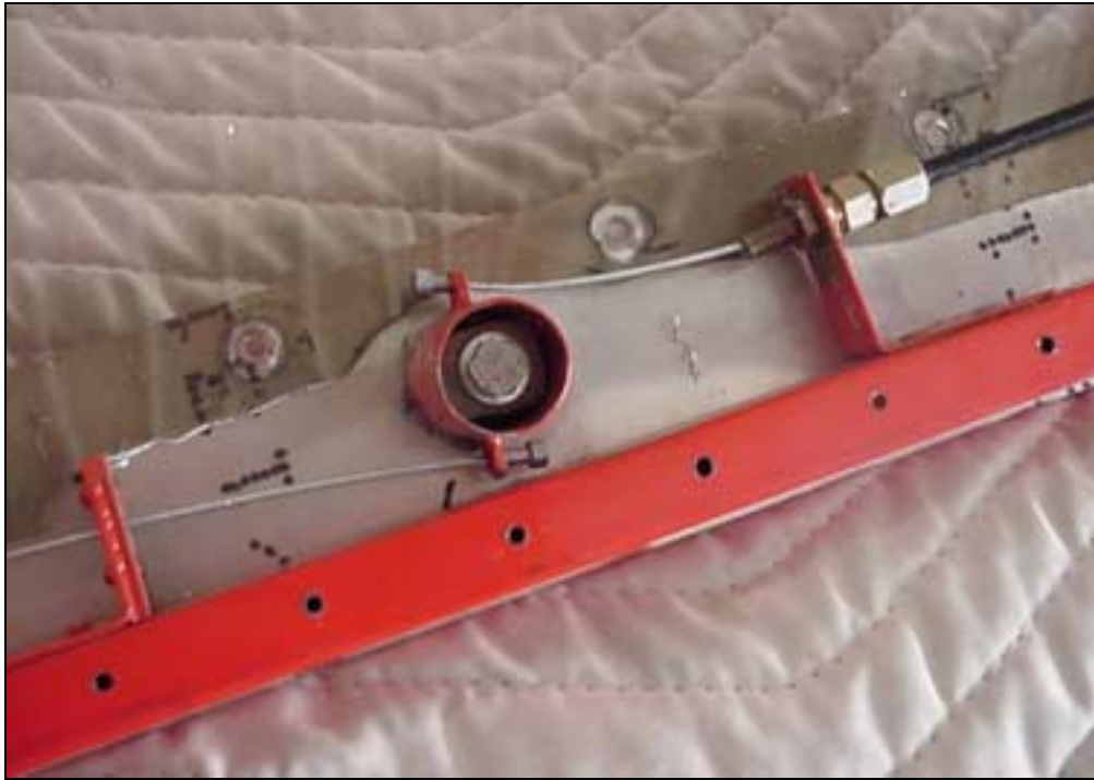
Canopy Cable Support 6C4-1