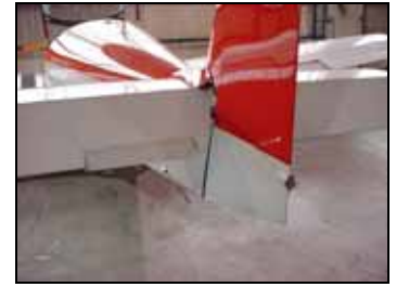
Rudder position tail light