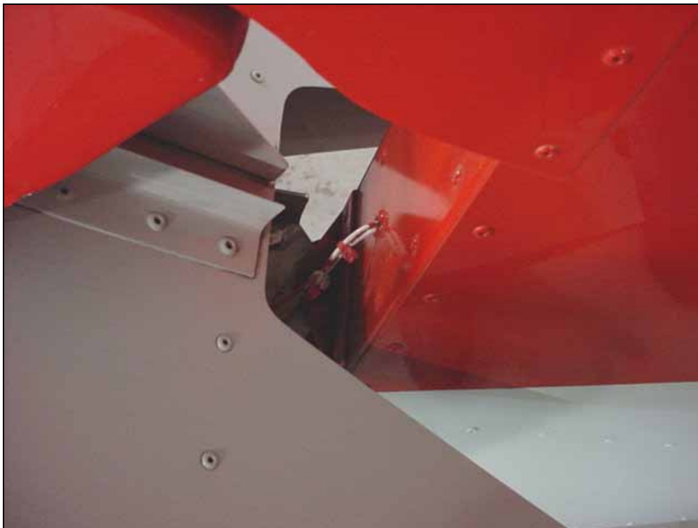
Grommet AN931-4-7 Qty: 1

The position light is installed after the rudder is completed (riveted). Approximately 160mm from the bottom of the rudder to the center of the light.