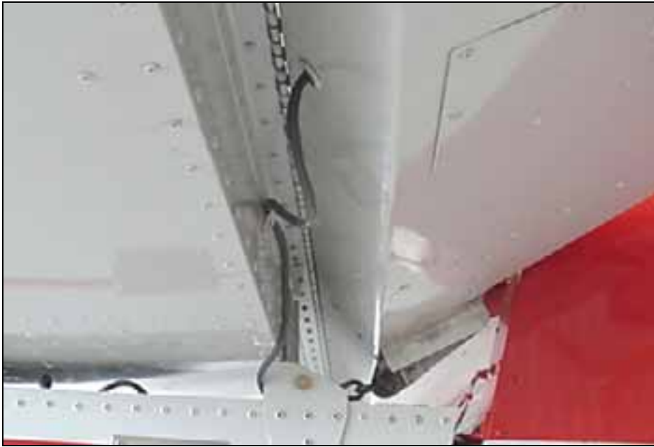
BELTON 5 WIRE The cable comes out the front of the elevator. Grommet located 30mm down from the top of the elevator. Grommet in the front of the elevator skin for the cable. AN931-4-7