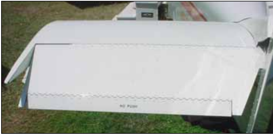
Full length recessed elevator trim tab.