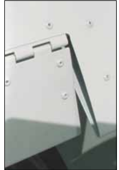
Detail of inboard end.