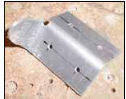
Pre-drill pilot holes.