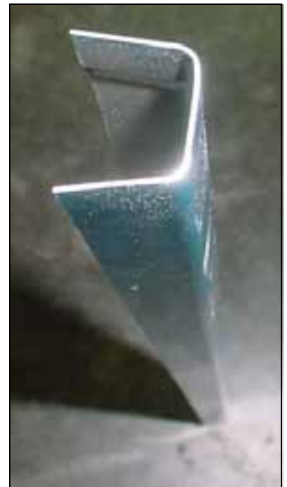
ELEVATOR CUTOUT CHANNEL 6T6-3/1