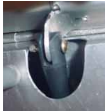
Install the Trim Motor arm assembly to the servo and to the Horn. The stainless steel threaded rod will have to be cut to length. Ref: bottom left diagram on 6-T-6.

CHECK: that the clevis does not interfere with the Horn. If necessary trim the Horn. Do not modify the clevis: see Ray Allen installation instructions.