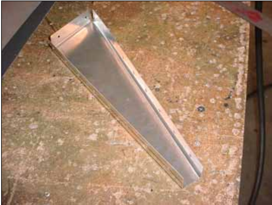
Middle rib 6T6-3, Ref. bottom middle diagram 6-T-6