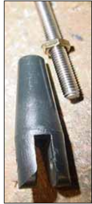
Control rod with lock nut.