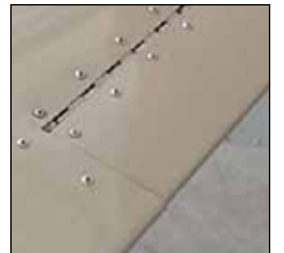
Trim tab in neutral position