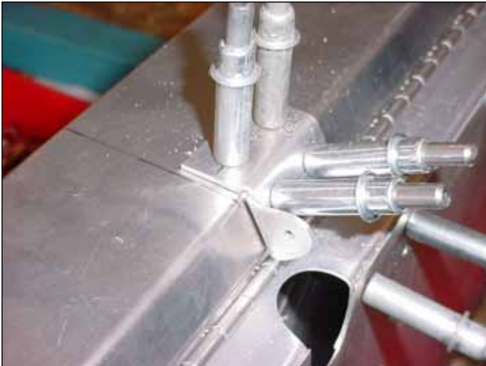
The Horn is positioned on the I/B side of the trim tab centerline.