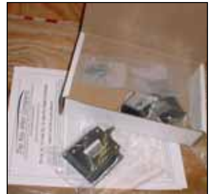
P/N T2-7A-TS (box content)

ORIENTATION: The servo will be riveted to the underside of the top skin. Lay the servo on the top skin in the same orientation, as it will be installed.