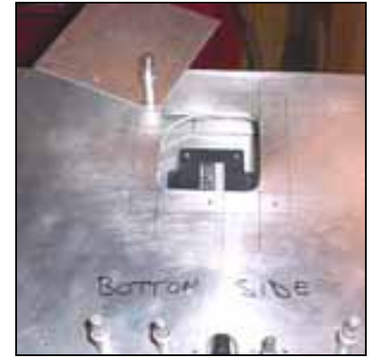
ACCESS HOLE COVER PLATE 6T6-5/0

Overlap = 19mm Overlaps on the outside of the skin.