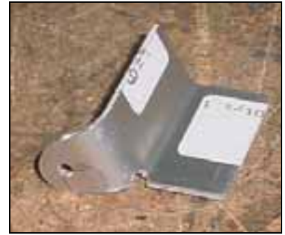
TRIM TAB HORN ANGLE 6T6-6/2