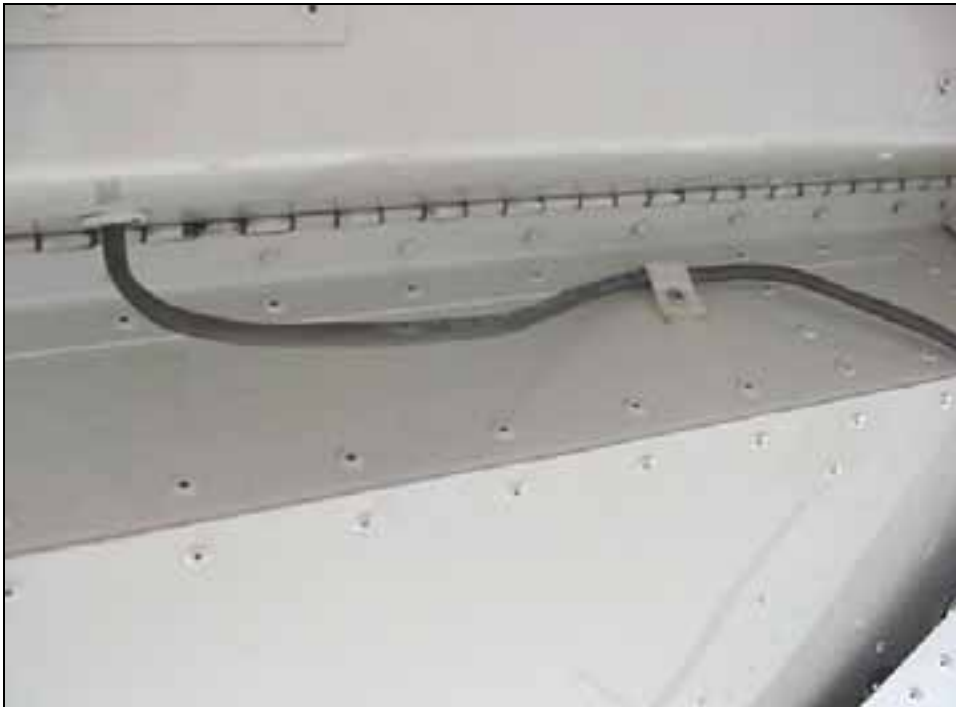
Photo taken with the elevator in the up position. Support strap riveted to the stabilizer to guide the cable to the fuselage.