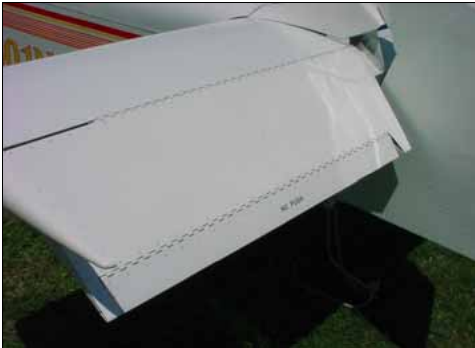
Trim tab along left trailing edge of elevator.