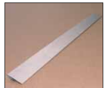
TRIM TAB SKIN 6T6-1/3

Lay the trailing edge of the elevator on a steel beam or on a straight board. Line up the trailing edge of the trim tab even with the trailing edge of the elevator skin.