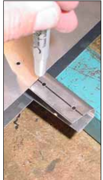
Cleco the rib and mark the top and bottom edge of the skin: Cut rib.