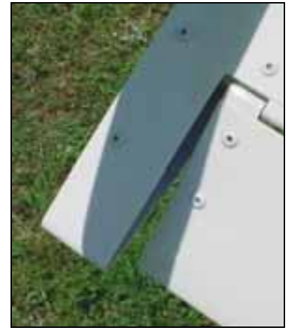
Detail of outboard end.