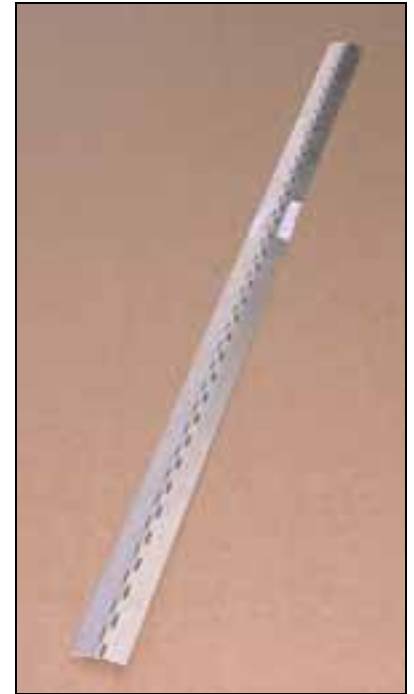
PIANO HINGE 6T6-4/2

Slide the piano hinge between the channel and the skin.