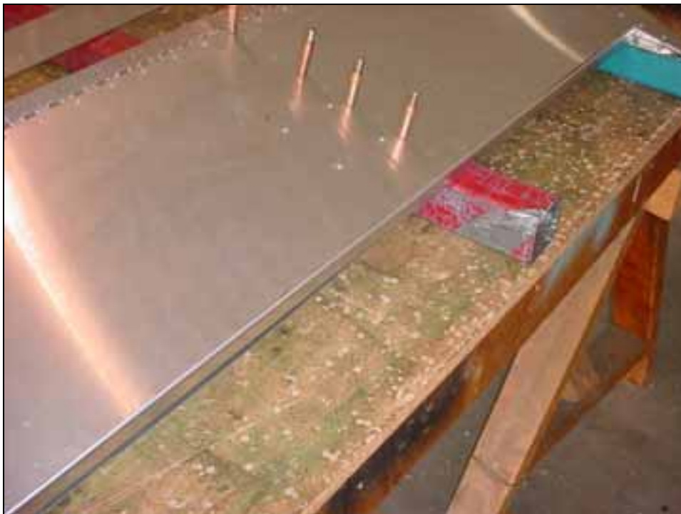
Install the channel with the web flush with the aft edge of the skin.