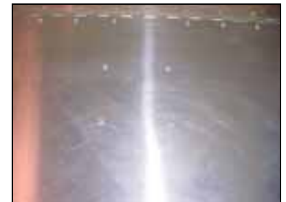
4 RIVETS A4 Servo to skin (rivets pulled from top side of the skin).

Cycle the trim servo to check trim tab deflections (refer to the instructions with the servo).