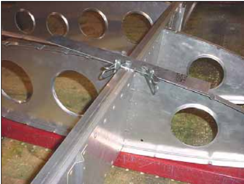
Check alignment, the height of the nose rib fits between the steel beam and the strip.