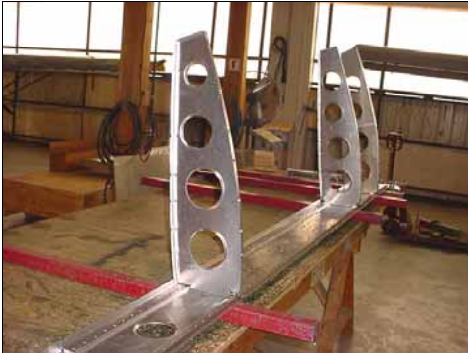
Clamp 3 ribs to the spar.