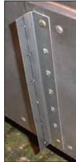
Layout the rivet pitch.