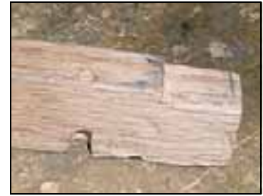
Joggling block: 3mm step by 25mm long