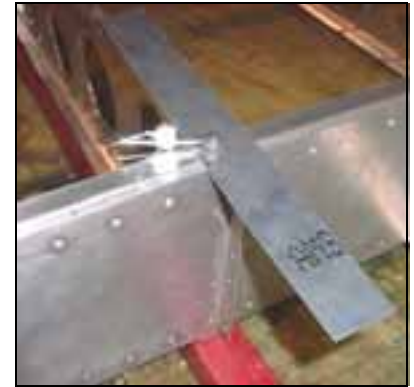
Clamp a strip to spar on top of the .025" material.