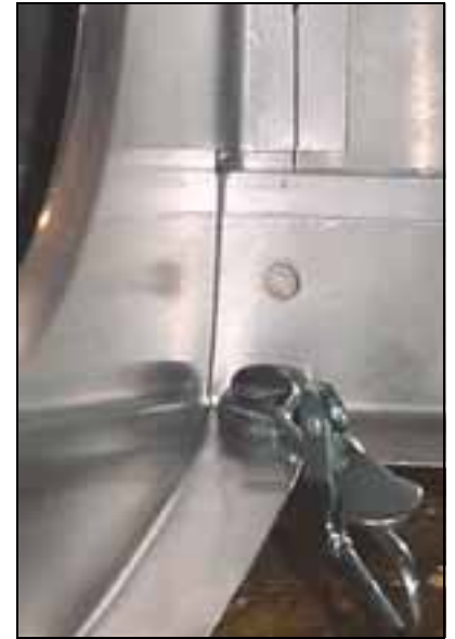
Line up the rivet line on the spar flange with the rivet lines on the spar web.