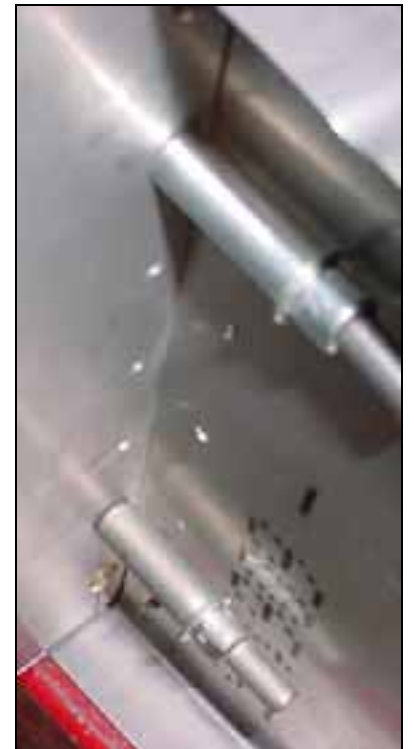
Aft edge of the nose rib is against the spar web from top to bottom.