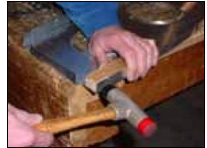
Top and bottom flange are joggled, check depth of joggle.

Ribs are supplied with joggled flanges top and bottom for overlap with spar angles.