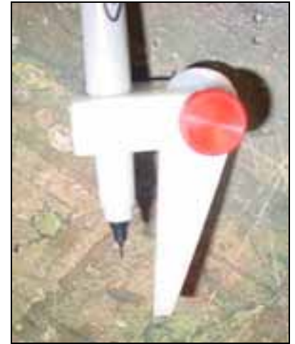
Edge marker block (adjustable) P/N 6352