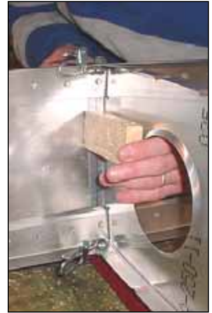
Backing block on the spar flange.

Apply press on the backing block to keep the rib flange from moving while drilling: Before drilling, check the rivets lines on the rib and spar web are in line.