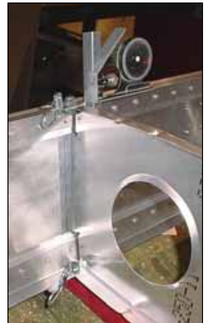
All the rear ribs are square to the top flange of the spar.

Finishing installing the rear ribs to the spar web. Nose ribs are installed next.