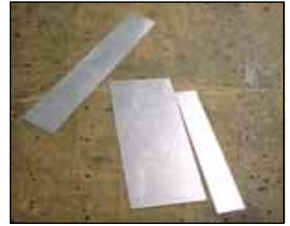
Flat pieces of .025" material and strip.

Slide a piece of .025" material between the beam and the bottom flange of the spar angle. The .025" represents the rear bottom skin 6W8-2