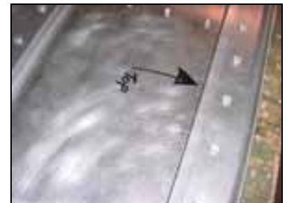
MARK: Identify the top side of the spar, and mark an arrow TOP (top spar cap angle 6W3-6 has the flange bend 90 degrees).

To make it easier to install the rear ribs, keep spar close to the edge of the workbench.