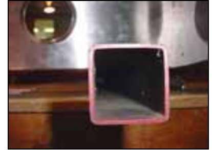
Steel beams (painted). Square 2"x2" length = 60" qty=6

Spar shown support on steel beam. When the rear ribs are clamped to the spar, the beams will keep the clamps off the workbench. Beams are also used to center the nose ribs on the spar.