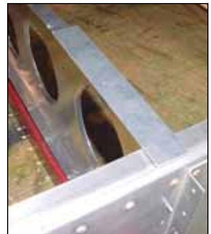
.025" strip top flange of cap angle 6W3-8

Also add a .025" piece on the top flange of the spar (to represent the rear top skin 6W8-3)