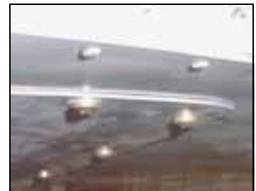
AN960-10 washer under screw.

When using A4 rivets (domed heads) to rivet the Z angles, there will be some separate between the edge of the door and the fuselage bottom skin.