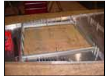
Cutout in fuselage bottom skin is reinforced with Z angles all around.