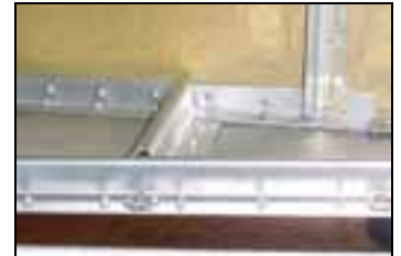
Short angle Cut and reinstall the short piece of L angle or Z angle between the longeron and the side Z angle

Aft left corner First install the front and aft Z angle (span wise stiffeners), then cut the side Z stiffeners to overlap the bottom flanges.