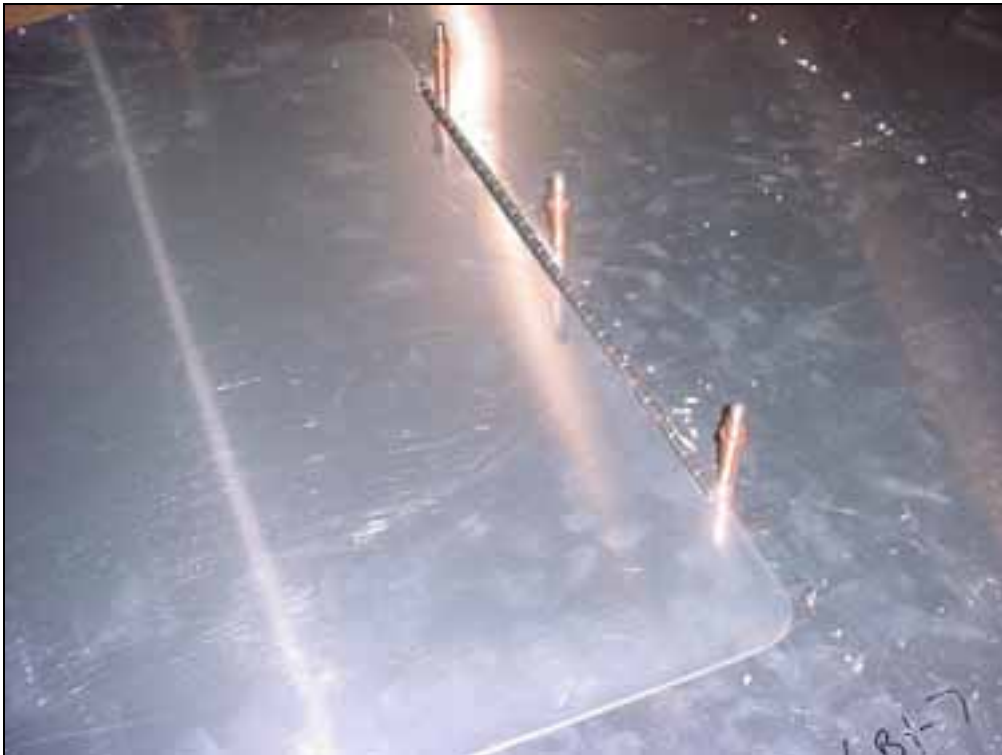
Looking inside the rear fuselage at the access door.

The L angle at 1535mm from the front edge of the fuselage (aft edge of the cutout) is replaced with a standard Z angle.