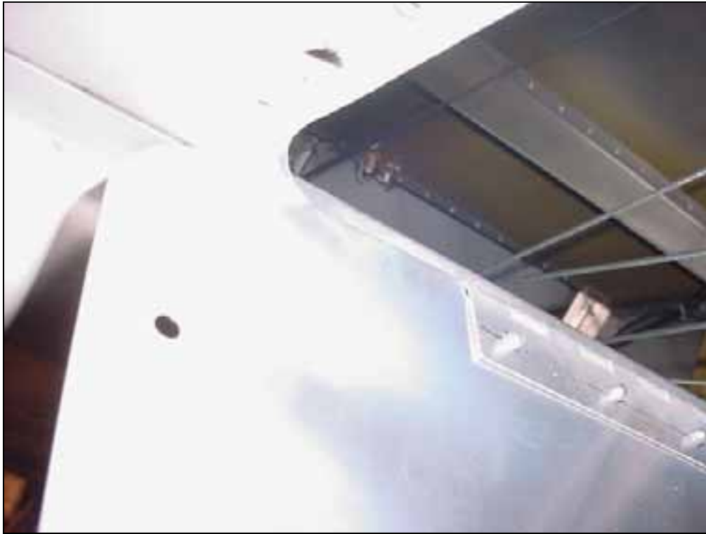
Front left corner.