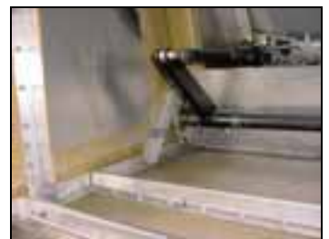
Access to flap control arm 6B19-2