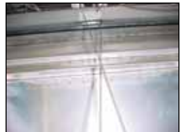
Access to cable fairleads through the rear frame channel 6B5-2