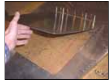
Photo of the bottom skin on the workbench, checking how the door will open and overlap along the side and aft edge.