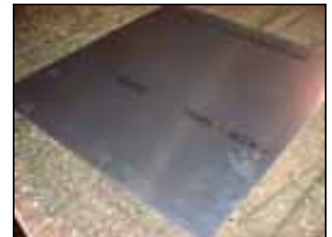
Access door 6-ADO-1-1

Top view of Z angle reinforcement around the cutout. Before cutting out the cutout, check to see how the door will overlap the sides and aft edge.