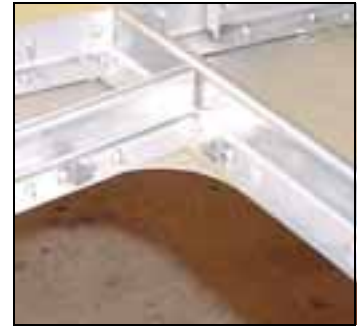
Z angle overlap on top of the Longeron 6B2-1

Detail of rear left corner of cutout Replace the aft L angle with a Z angle, back drill through existing holes in bottom skin.