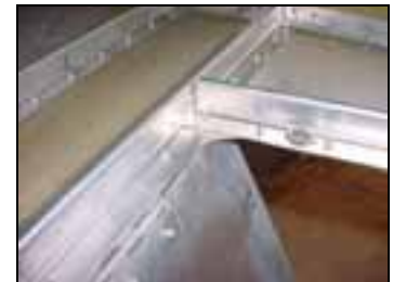
Cutout is framed with Z angles all around.

Note: The front edge of the door is flush and even with the front edge of the cutout.