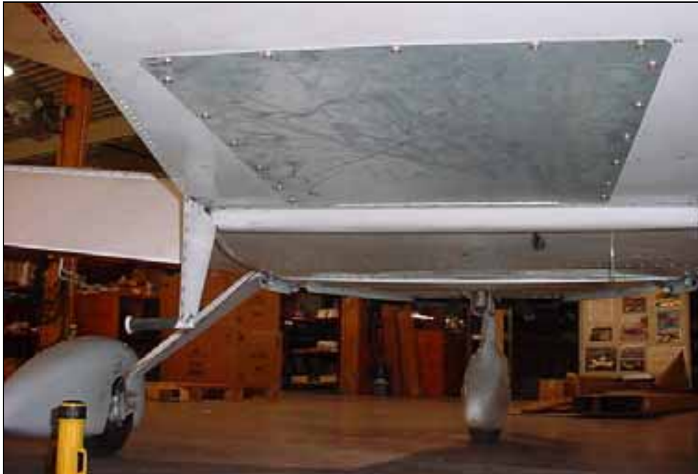
Bottom fuselage access door option