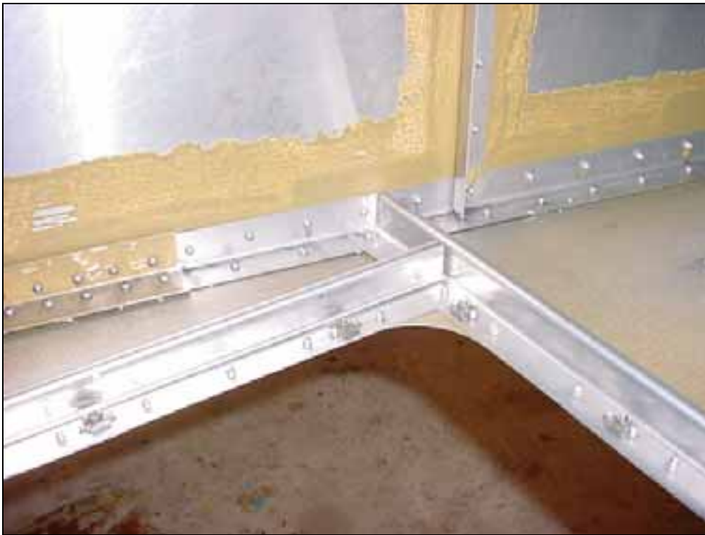
Aft right corner