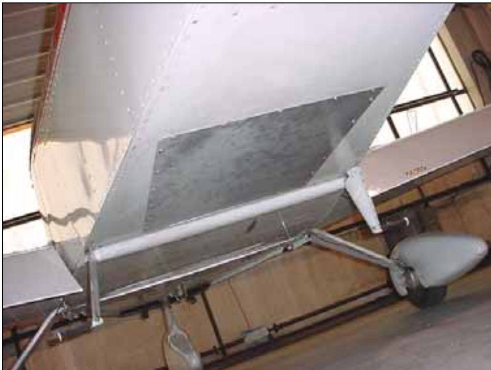
Access door located behind fuselage step fairing 6G3-5