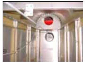
Access to lower cable fairlead on 6B1-1