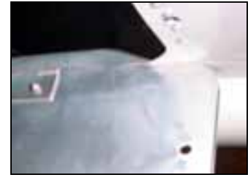
Detail looking up at the front right corner of the cutout.