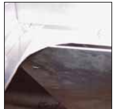
Corner radius = 15mm (all 4 corners)

Note: The top flange of the Z angles point away from the cutout.