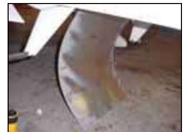
Flexing door forward.