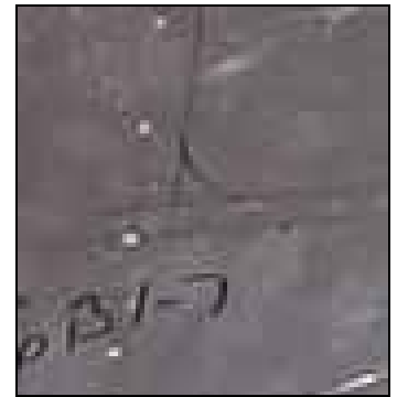
Detail of corner radius R15 tangent with edges of cutout (all 4 corners).

Layout the cutout on the under side of the bottom skin 6B1-4. The cutout is symmetrical about the aircraft centerline.